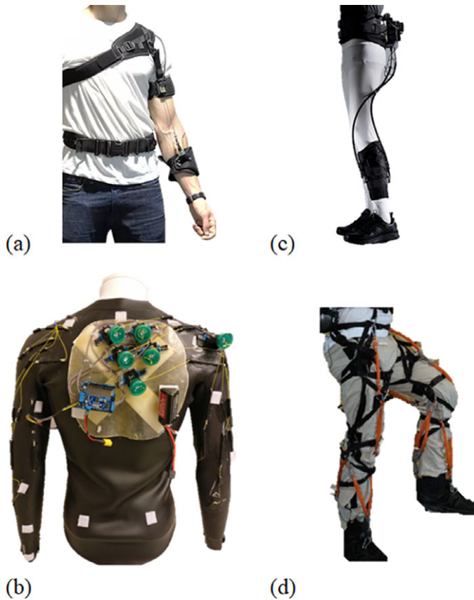
Figure 3. Examples of soft exoskeletons: (a) the research upper limb soft exosuit from Aries Lab (Xiloyannis et al., 2019), (b) the CRUX soft upper limb exosuit (Lessard et al., 2018), (c) the research lower limb soft exosuit from the Wyss Institute (Kim et al., 2019a,b), and (d) a lower limb pneumatic soft exoskeleton (Wehner et al., 2013).

performance of the overall system if not compensated (Jeong et al., 2020). Furthermore, given their soft nature, the interface points where the human limb is anchored introduce a low-stiffness series compliance that would need high actuation power and appropriate bandwidth to be overcome (Chiaradia et al., 2019). Figure 3 shows examples of upper and lower limb soft exoskeletons.