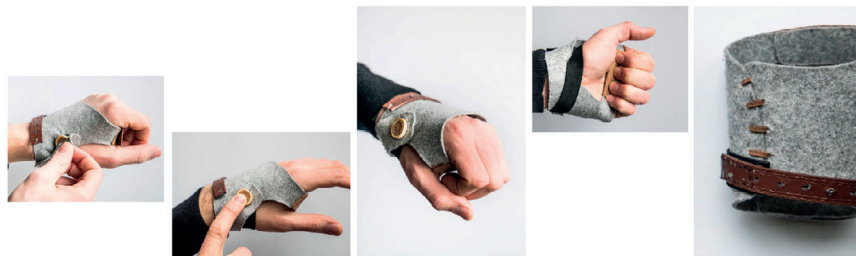
Figure 4. Relaxation training glove intended to be friendly, intuitive, and respectful. Design by Felix Quadvlieg

The sensorial and semantic appeal of the technology is important to users considering their acceptance and