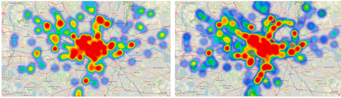
Fig. 1. Spatial distribution of origins (left) and destinations (right) included in the choice set.