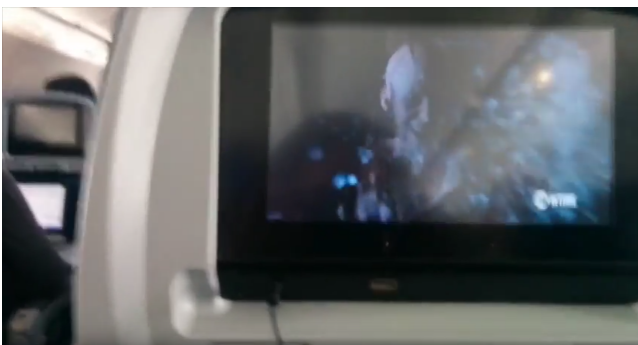
(d) Glare on the screen makes it almost impossible to see what is going on.