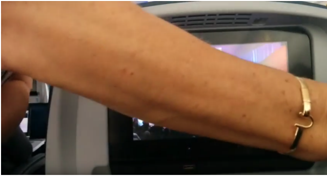
(b) The user gets distracted from the movie by a stewardess serving something to the neighbour passenger.