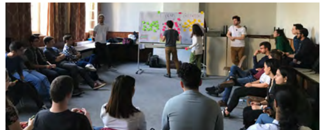
Figure 4: Train new trainers held in Leuven (Belgium). March 2019

During this event, participants from different European universities will have 24 hours to propose a solution to the challenge chosen and proposed by the companies collaborating within the competition. The solution achieved will be evaluated by taking into consideration several criteria, such as its business and technological feasibility among others. This project is being held in collaboration with Knowledge Innovation Market (KIM) Barcelona after a first online edition that proved to be successful.