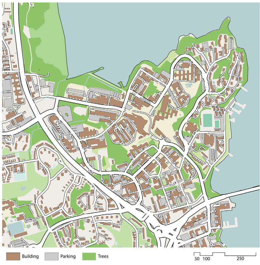
FIG. 5.1 Otaniemi area built environment.

supply and demand control mechanisms, such as a higher degree of parking space centralization, reducing parking minimums, and introducing parking pricing. However, as can be seen from Fig. 5.1, the area still has plenty of distributed parking areas. Finally, from the perspective of policy and planning processes, Otaniemi is a good representative example as there are several layers of actors intersecting their domains of responsibilities, from private landowners, through city and regional spatial planning organizations, to national transport planning and other diverse stakeholders, such as various tech companies located in this area.