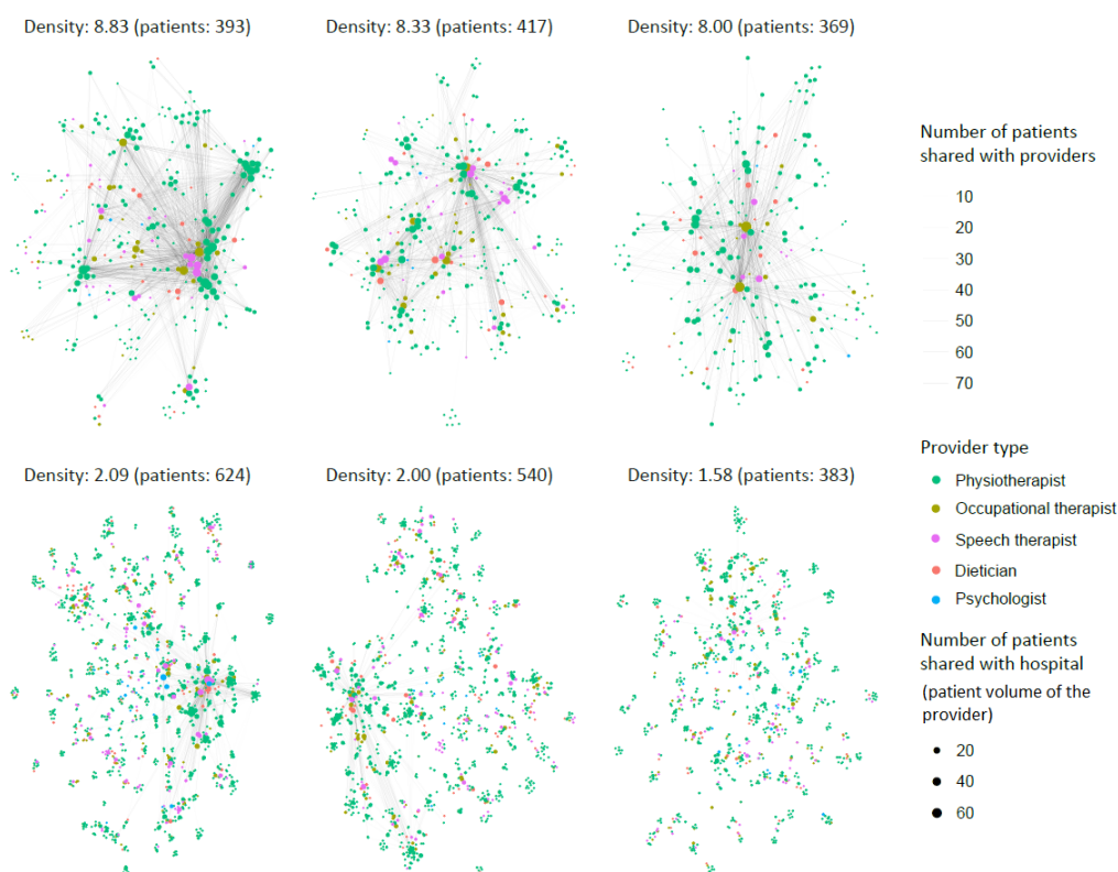
Figure 2. t-SNE Visualization of Top 3 and Bottom 3 Hospital Populations in Terms of Average Density Scores. Abbreviation: t-SNA, t-distributed stochastic neighbour embedding.

Healthcare costs seemed to be negatively associated with density scores (Table 2). A doubling of the density score was associated with reduced healthcare costs of approximately 1.2% (complications excluded) to 2.1% (complications included). Compared to the average healthcare costs for PD (Table 1), this would equate to an annual reduction of $2406 to $4522 per patient (over 36 639 patients, this corresponds with $0.9 million to $1.7 million). Supplementary file 1 shows the complete regression analyses on health outcomes (Table S1), healthcare utilization (Table S2), and healthcare costs (Table S3).