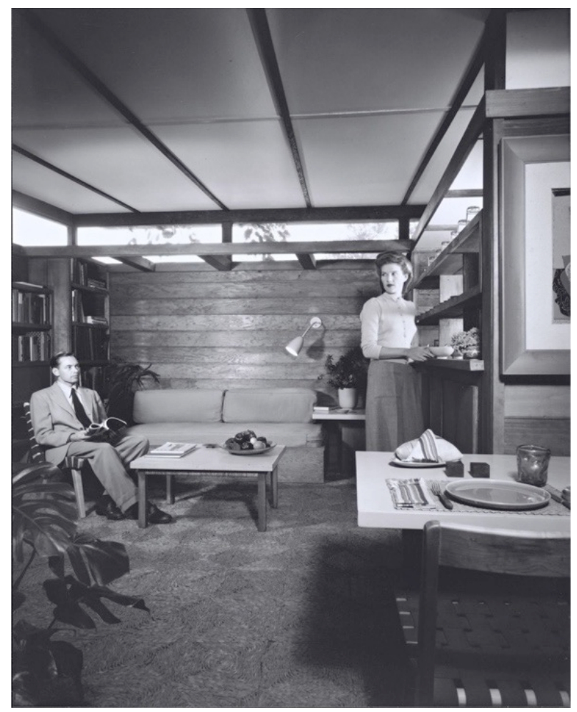
Fig. 7 People as models in carefully arranged scenes.

Modern photographers like Baan approach people in a different way. To show how buildings are really used he pays more attention to spontaneous human activity and tries to capture the moments instead of planning them. Thanks to that people become equally important as architecture in which they live, and together create very coherent, lifelike image. He approaches building without a specific knowledge of how it should be used and tries to record the way of the how people use it.<sup>21</sup> This type of work reassembles the reversed manual, where photographer learn from the users of space the intention of architect, which sometimes may not be compatible with each other. Those two contradictory strategies of treating people in architectural photography are to be seen in yet another pair of images ( Fig. 7, Fig. 8 ).