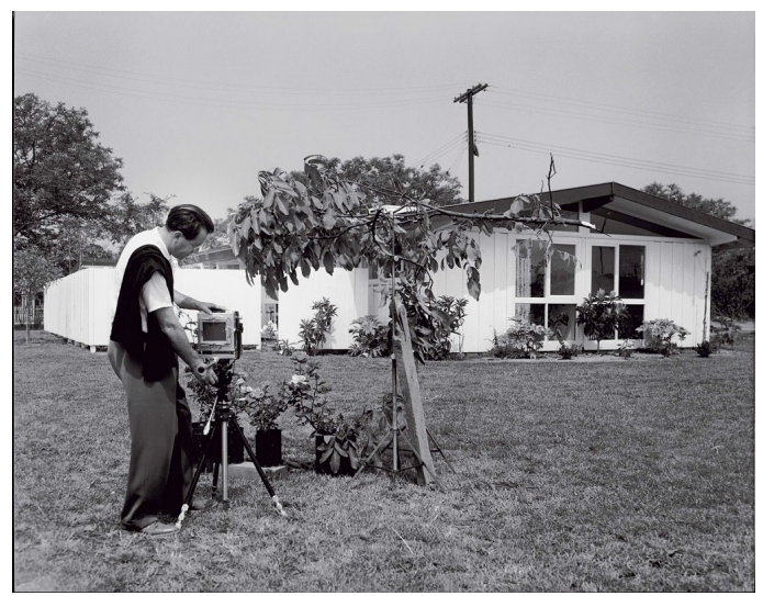
Fig 5a. Shulman "Dressing a Photograph"