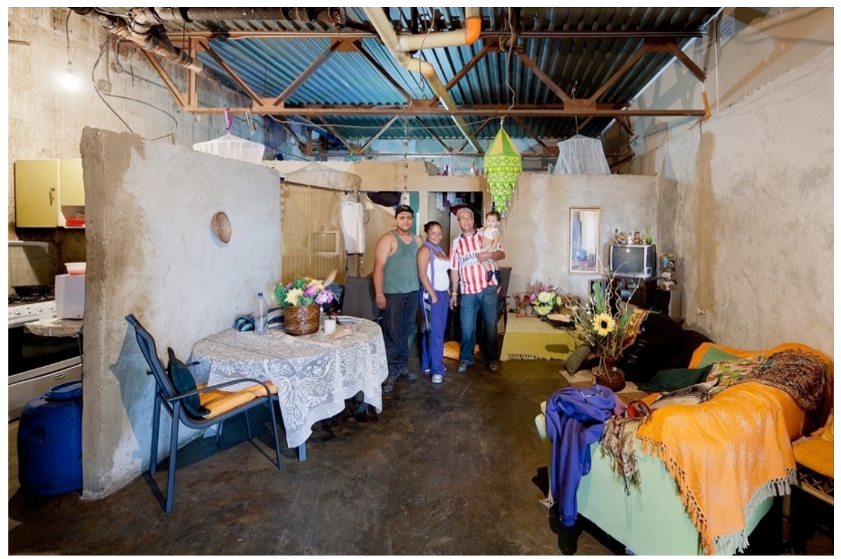
Fig. 10 Domestic life inside the abandoned buildings in South America in 21st century which emerged organically due to the lack of affordable housing. (Caracas, Venezuela)

Second picture was taken inside Torre David, an informal settlement organized in an unfinished office tower in the heart of Caracas, Venezuela. Construction of the building started in 1990s, but due to several economic and political events it has never been completed. It stayed abandoned for more than a decade until in 2007 it was inhabited by residents who escaped the disastrous flooding of Barrios surrounding. Nevertheless, it was not the first informal settlement in Caracas. When in 1960s the city experienced unprecedented economic growth thanks to massive oil exports, new urban habitats started to emerge inside the city and around it. The latter were usually inhabited by the people, who could not afford living in the center and therefore started forming communities on the outskirts of Caracas. Owing to lack of adequate social housing policies, those informal settlements spread out creating chaotic patchwork of temporary buildings which replaced the once green areas. That led to dramatic change in water retention and made a city prone to floods more than ever before. Natural disasters at the beginning of 21<sup>st</sup> century made many people look for new homes in abandoned buildings like Torre David, which become one of the biggest informal settlements, having its own administration, services, and utilities.<sup>27</sup>