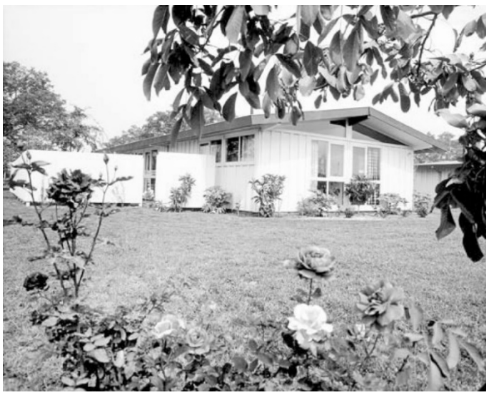
Fig 5b. Outcome photograph