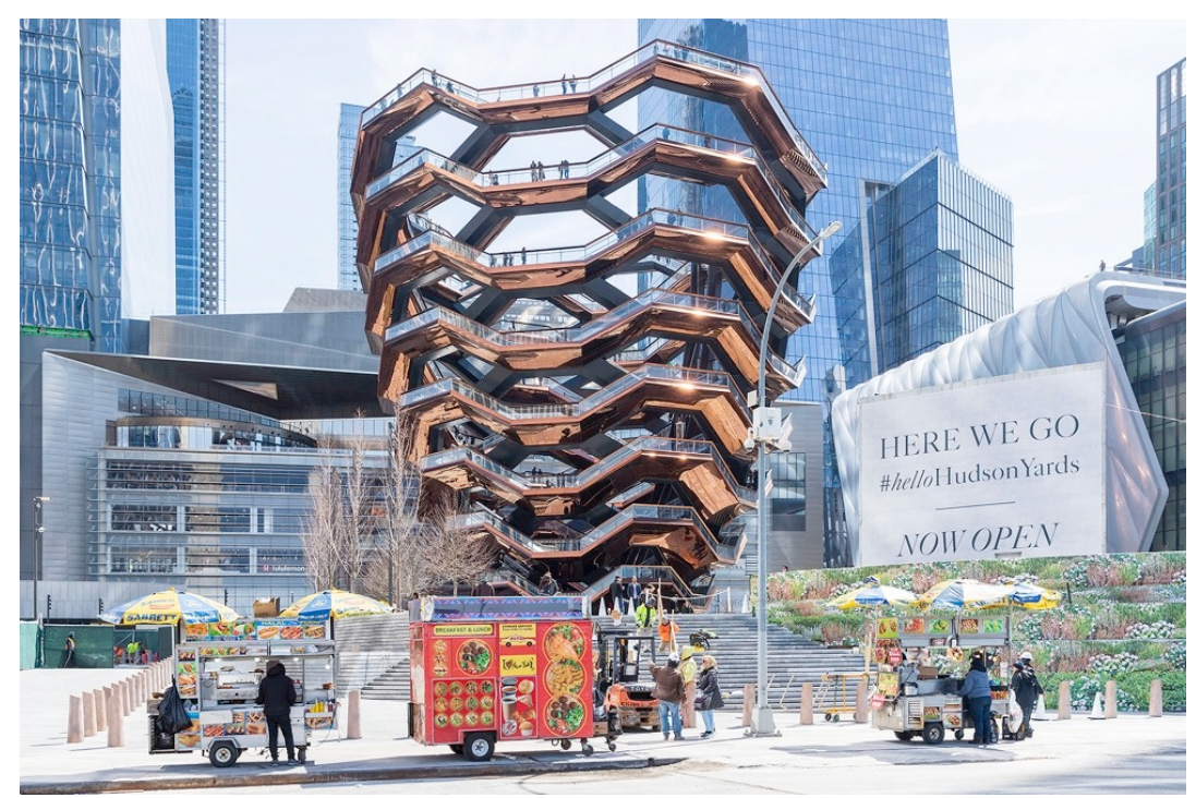
Fig.6 The Vessel, New York by Iwan Baan