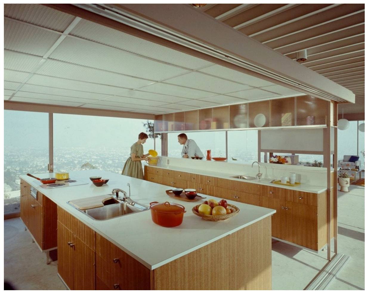
Fig. 9 Promoting new model of life in the United States in 1950s through a photography of Julius Shulman.

Most of Shulman's work was devoted to the idea of domesticity in very specific form, characteristic for the late 1950s in the United States. Individual house in modern shape became a symbol of a new post-war lifestyle of American middle-class citizens. At the time, images not only promoted architecture itself, but also a certain vision of society<sup>25</sup>. In this way, Julius Shulman's artwork became influential, and shaped the imagination of hundreds of Americans. First picture presented in this part ( Fig. 9 ) resembles the one from colorful magazine, with elements like architecture, furniture, landscape, and people arranged to promote new model of living. Iwan Baan started his career in a modern, globalized world. Even he was born and raised in the Netherlands, his scope of interest as an artist lays way beyond the national borders. Great part of his work as a photographer is dedicated to domestic life in developing countries within areas of informal, spontaneous inhabitation. He shows how people settle inside abandoned buildings and administrate them in self-sufficient, independent communities. Second picture ( Fig. 10 ), as much as similar in topic to the work of Shulman, presents drastically different concept of domesticity. Here, instead of imaginary vision of bright future, we are confronted with securing the most basic needs inside the abandoned skyscraper in Caracas due to the lack of affordable housing in Venezuela.