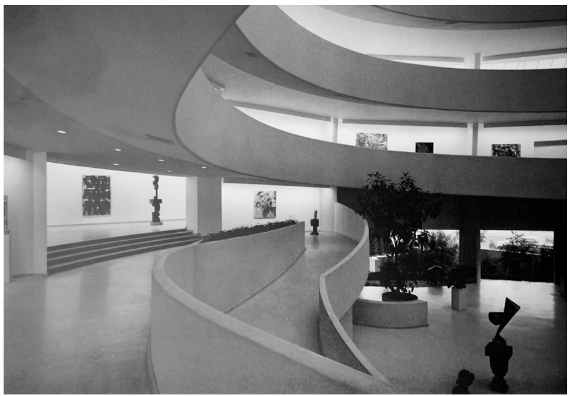
Fig 11. Guggenheim Museum, New York – Julius Shulman