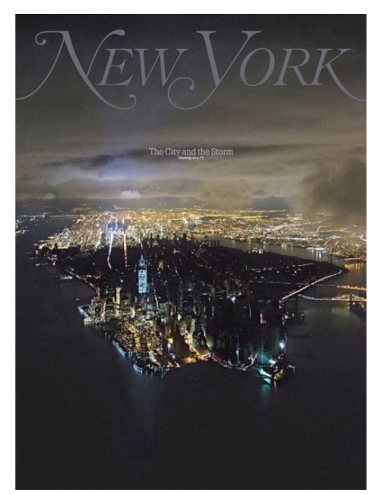
Fig. 2 "New York Magazine" – cover by Iwan Baan

"New York Magazine" from November 2012 features amazing, aerial photograph made by Iwan Baan just after hurricane Sandy hit the eastern coast of the United States. Composition of vertical image is centered on the part of the city drowned in complete darkness, with only several light spots of skyscrapers visible. In the background, miles away from the observer the city lightens up again, magnifying the contrast of light and dark. This shocking moment showed on the cover page of popular magazine might convey a powerful message about vulnerability of human civilization, hopeless when encounters unpredictable natural forces. That feeling is enhanced by use of aerial perspective, which is one of the trademarks of Baan's work and helps to unknowledge the vast size of the blackout area.