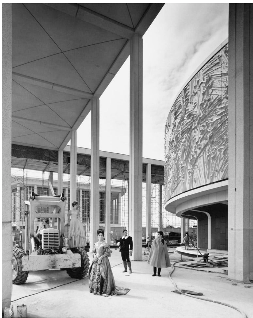
Fig 3. Los Angeles City Hall – Julius Shulman