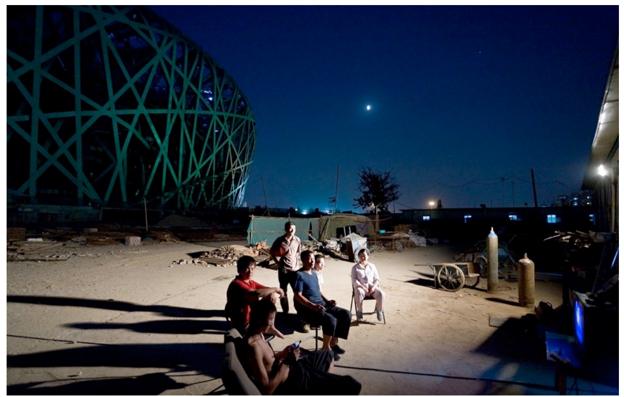
Fig 4. National Olympic Stadium in Beijing – Iwan Baan