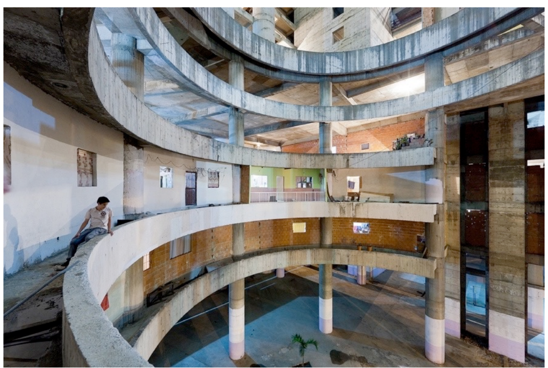
Fig. 12 Torre David, Venezuela – Iwan Baan