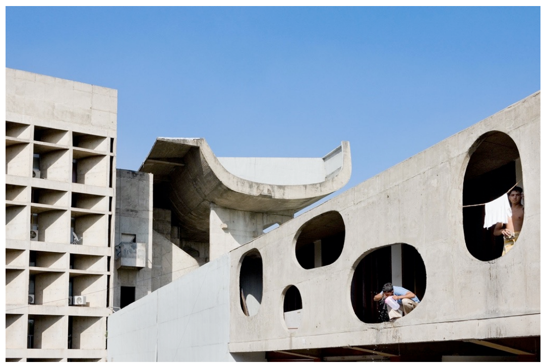
Fig. 8 Spontaneous use of space; Contradiction between the architect's intention and reality

First picture presents a couple, woman, and man inside the house. Elegant interior design with wooden-cladded walls and patterned carpet on the floor creates an intimate and warm feeling of space. Stylish furniture was carefully arranged to match the character of the building. Horizontal windows placed just below the level of the ceiling let some natural light to get inside the room, which is also additionally brightened with an artificial light. People standing in the room are very static, even though they clearly take part in household activities. Man, sitting on the armchair, reading the newspaper raised his head to look at the woman, which is likely his wife. The latter stands in front of the kitchen annex, holding the bowl with food. In the foreground one can observe a table with only one set of cutleries. This kind of images often acted as a manual of the modern living, being published in magazines like "The Sunsel" mentioned in the first chapter. Every single aspect of the scene was set to guide the reader how to use the house and its elements from the scale of the room to the single piece of furniture.<sup>22</sup>