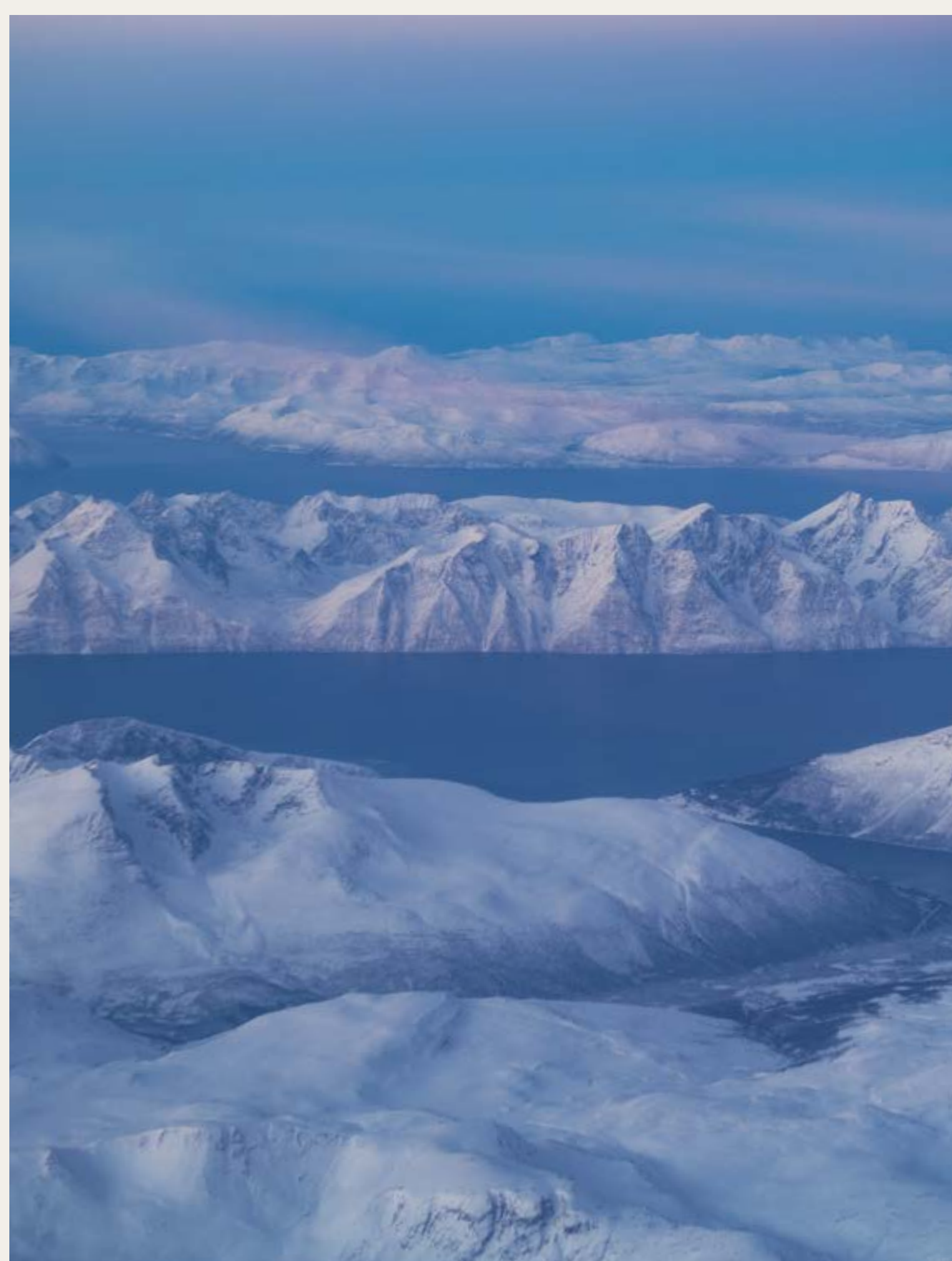
Symphony of Time and Architecture