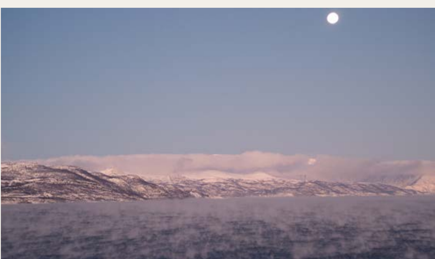
Appendix III: Documenting the Temporal Landscape: A Journey through Seasons in Alta - Winter

This appendix takes a deep dive into the temporal landscape as a performance, examining how architecture and nature interact and evolve over time. Rather than being static entities, the landscape and architecture are dynamic and ever-changing systems that continuously unfold like a performance.