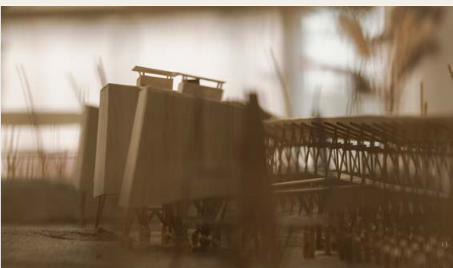
Assembling the Arctic Symphony

The design booklet, "Assembling the Arctic Symphony," is a visual narrative of the architectural journey undertaken for the Arctic Symphony project. Comprised of images from various models created throughout the process, along with axonometrics and sections, this booklet encapsulates the essence of the design. It also showcases a collection of materials sourced directly from the site, creating an intimate bond with the Arctic landscape.