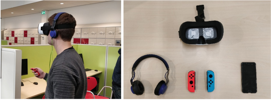
Fig. 1. The setup used to play Loud and Clear