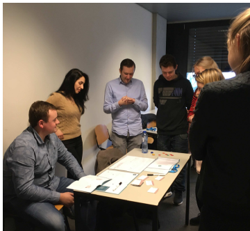
Figure 1 Discussion with grid operators (picture used with permission)

The challenge in the game is to reduce the CO 2 emissions in the district back to ZERO! Additionally, participants should achieve energy consumption reduction by 50%, and produce all energy locally. The transition process is not determined yet, so the participants need to think about strategies to reduce energy demand, and produce green energy locally. Cooperation and coordination is necessary, but they must consider their personal values as well as their financial possibilities and consumption pattern.