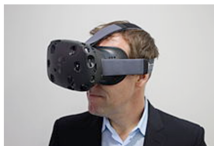
Figure 2. Virtual Reality Headset (Goggles)

Virtual reality (VR) is a computer technology that uses special headsets to generate images, sounds and other sensations that imitate a real environment or create an imaginary setting. It can also simulate a user's physical presence in this environment. It is a simulated 3D 360-degree environment which can be experienced or controlled by movement of the body or a computer. One can look around in the artificial world using VR equipment like the headset, which are head-mounted goggles with a screen in front of the eyes. Programs may include audio and sounds through speakers or headphones. Some VR systems used in video games can convey vibrations and other sensations to the user through the game controller. It also supports remote communication environments through a type of telepresence or tele-existence. The expectation is that VR will quickly develop and the goggles (figure 2) certainly will not be the end product as was shown by the success of Pokémon Go (Carlton, 2017).