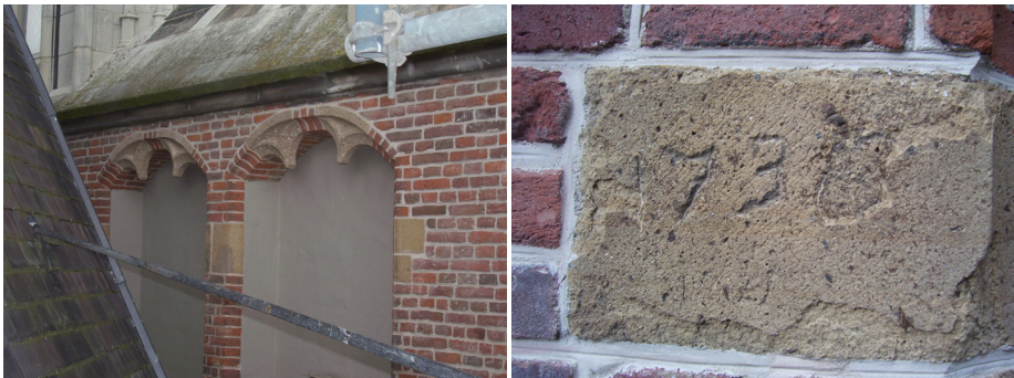
Figure 9. Blocks of Laacher tuff on the crossing tower of St. John's cathedral, 's-Hertogenbosch, dating back to the 1730's.

Trass, used as a pozzolanic addition to lime mortars to give these hydraulic properties, is ground tuff, in particular from the Brohltal. Though the raw material is of German provenance and has been denominated as Rheinische Trass , Brohler trass , en Andernacher trass , trass was widely perceived as a Dutch invention, as illustrated by the French terrasse de Hollande [De Béliador, 1737-1770] and English Dutch trass . The fact that blocks of tuff were imported and ground locally probably contributed to this perception. Trass became a widely known, well reputed material, to such an extent that 19 th century travellers wrote of the ' trass valley of Brohl ' [Hibbert, 1832].