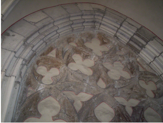
Figure 3. 15 th Century blind tracery in the cloister of the Utrecht Dom cathedral.