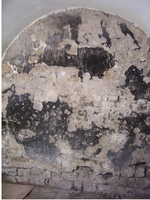
Figure 1. Remains of the Roman castellum wall in a cellar at the Dom square, Utrecht. The lower part is original Roman masonry (ca. 210 AD), the upper part was rebuilt in pre-Medieval times.

castellum in the German city of Xanten from the local St. Vitus Church to quarry it for tuff [Bartels, 2006] and also obtained tuff from Roman Cologne [Hirschfelder, 1994; Bartels, 2006].