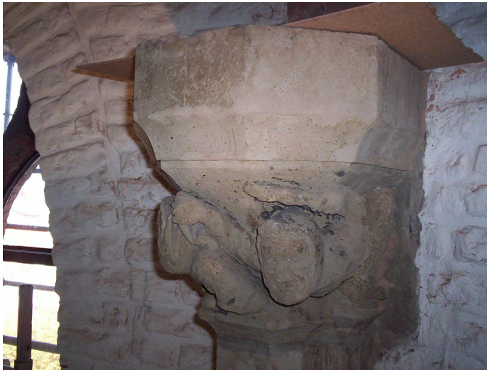
Figure 4. Early 15 th century corbel in Weibern tuff, St. Peter's church, Leiden.

During the 18 th century, the tuff quarry industry in the Eifel area suffered a period of strong decline, the last firm in the area being closed in 1787 [Hoss, 1922]. From about 1850 onwards, in line with expansion of German industry in general, quarrying and use of tuff was revived. Whereas Römer tuff had always had the advantage of a direct and easy connection to the main transport axis, i.e. the river Rhine, quarry centres of Weibern and