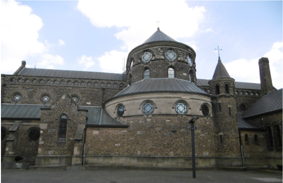
Figure 6. Ettringen tuff on the 1930's St. Jacques the Greatest church, Enschede, by architects H.W. Valk and J.H. Sluijmer.