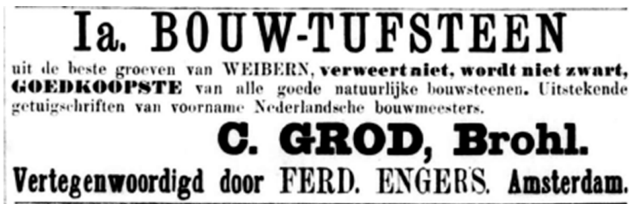
Figure 5. Advertisement for Weibern tuff, to be obtained via F. Engers, Amsterdam, in the Dutch architectural magazine De Opmerker , April 14, 1894. The text above the firm names reads: ‘Building tuff stone from the best quarries of Weibern, does not weather, does not become black, cheapest of all good quality natural stone. Excellent references by the foremost Dutch architects.’

Ettringen tuff, such as the villages of Bell, Engel, Ettringen and Weibern, got a more efficient transport connection only when the railway of Andernach–Niedermendig and the Brohltal railway were established in 1879 and 1900, respectively, connecting the tuff areas to the Bonn-Koblenz railway that had been established in 1858 [Hoss, 1922]. The Brohltal railway, used by the Weibern quarries, however, was small track only, making additional expensive overloading to the regular railway system necessary [Hoss, 1922], a disadvantage the Ettringen quarries were lacking. Though the fast development of the European railway system stimulated the use of natural stone from many sources in the Netherlands [Dusar & Nijland, 2012], Weibern tuff transported in the old way was still cheap in the late 19 th century. In 1893, the Amsterdam-based stone merchant Ferdinand Engers (Fig. 5), for example, intervened in a discussion on French limestones [cf. Nijland et al., 2015], stating: ‘to attract the attention of the reader to another material, that, though used in this country on a large scale, does not at all receives the appreciation that it should get from both an aesthetical and economical point of view. I aim at the tuff stone from the good quarries of Weibern. This material is cheaper than most kinds of stones, especially when it can be transported by ship’ [Engers, 1893].