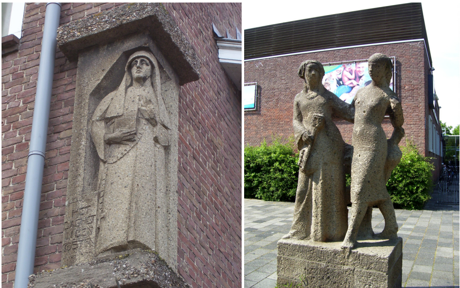
Figure 7. Monumental sculptures in Ettringen tuff. Left a sculpture of the nun Geertruyt van Oosten by Pieter Biesiot (1926) on the Cornelius Musius school in Delft, right Free standing sculpture in Ettringen tuff, called 'The old and the new town' by Paul Grégoire (1939), also in Delft.