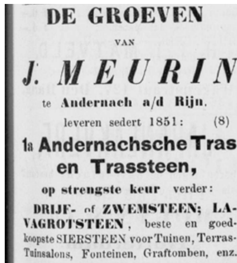
Figure 10. Example of advertisement for trass from Andernach, as delivered by the quarries of J. Meurin since 1851 from the Dutch architectural magazine Architectura , January 7, 1883.

Rhenish tuffs are amongst the most prominent natural stones on Dutch monuments of all ages. They have widely been used in the Netherlands, first by the Romans, and later from the romanesque times onwards. During the earliest phases (10 th -13 th century), only Römer tuff was used, followed by Weibern tuff in the 15 th -16 th century. Ettringen tuff was introduced as late as the last quarter of the 19 th century, both for restorations and new buildings, simultaneously with reintroduction of Weibern tuff. Remarkable differences exist between the durability of medieval and 19/20 th century Weibern tuff, as well as between Ettringen tuff used in 19/20 th century restorations and early 20 th century new buildings.