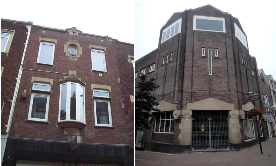
Figure 8. Ettringen tuff building parts in red clay brick masonry. Left a residential building at Hogehuisstraat 13, Eindhoven, built 1939, right Hoogstraat 99, Schiedam.

Besides the tuffs mentioned above, a few other types have been used. At the crossing tower of St. John's cathedral, 's-Hertogenbosch, several blocks of an orange brown variety of tuff are present, with an inscription dating them to 1738 (Fig. 9). They are strongly reminiscent of the orange brown tuff, as used in the first, 12 th century, building phase of Maria Laach