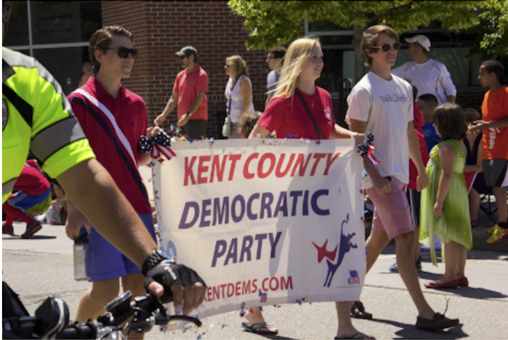
Figure 1: Example of image containing private information [1]

While current research on privacy preservation in crowdsourcing focuses on worker privacy [2], by developing user modeling and task assignment methods that exploit user properties while protecting their private information, less attention has been devoted to the issues of content privatization - i.e, developing methods that reduce the risk of leaking private information from the content of the task, while still allowing the workers to complete it. Given the growing need for annotated data, the demand for privacy-aware content management, and stricter privacy protection regulation, there is a clear need for efficient and effective methods for privacy preservation in the content of crowdsourcing tasks.