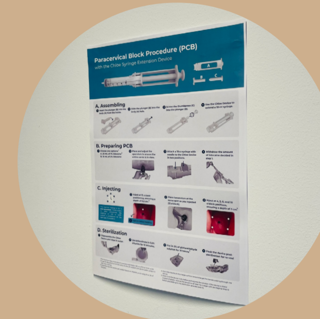
Hang on the wall for guidance through the procedure.

The demonstration device helps the trainer to demonstrate the cervix with its injection sites. It is also useful for teaching how to perform the procedure and can be used by the nurses for practical training.