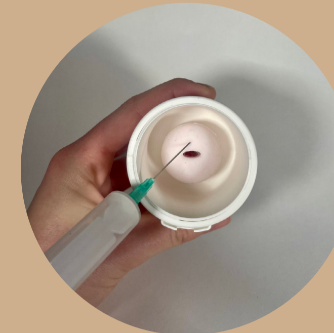
Demonstrate the cervix with injection sites.