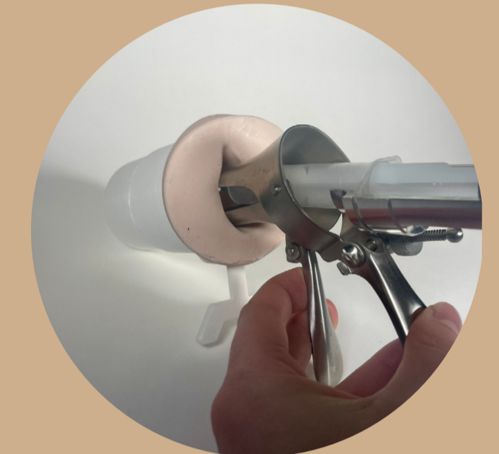
Provide training on how to perform the procedure.