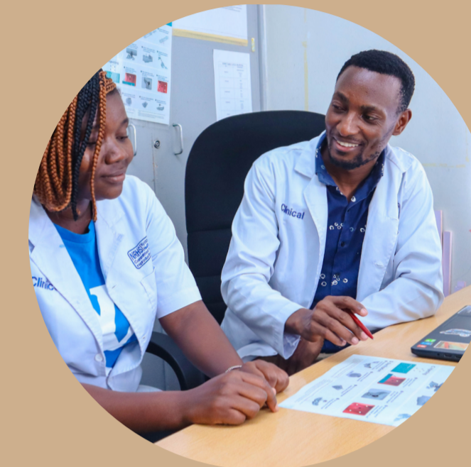
Use for training purposes for medical professionals.