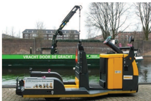
Figure 3. The Mover (Mokum Mariteam, 2012)

When the vessel are loaded, they sail among the old canals to the inner-city (see Figure 2). Not all the canals are suitable for these freight vessels. In our model dedicated canals are specified considering the width and headroom of the vessels (an de Kamp, 2016).