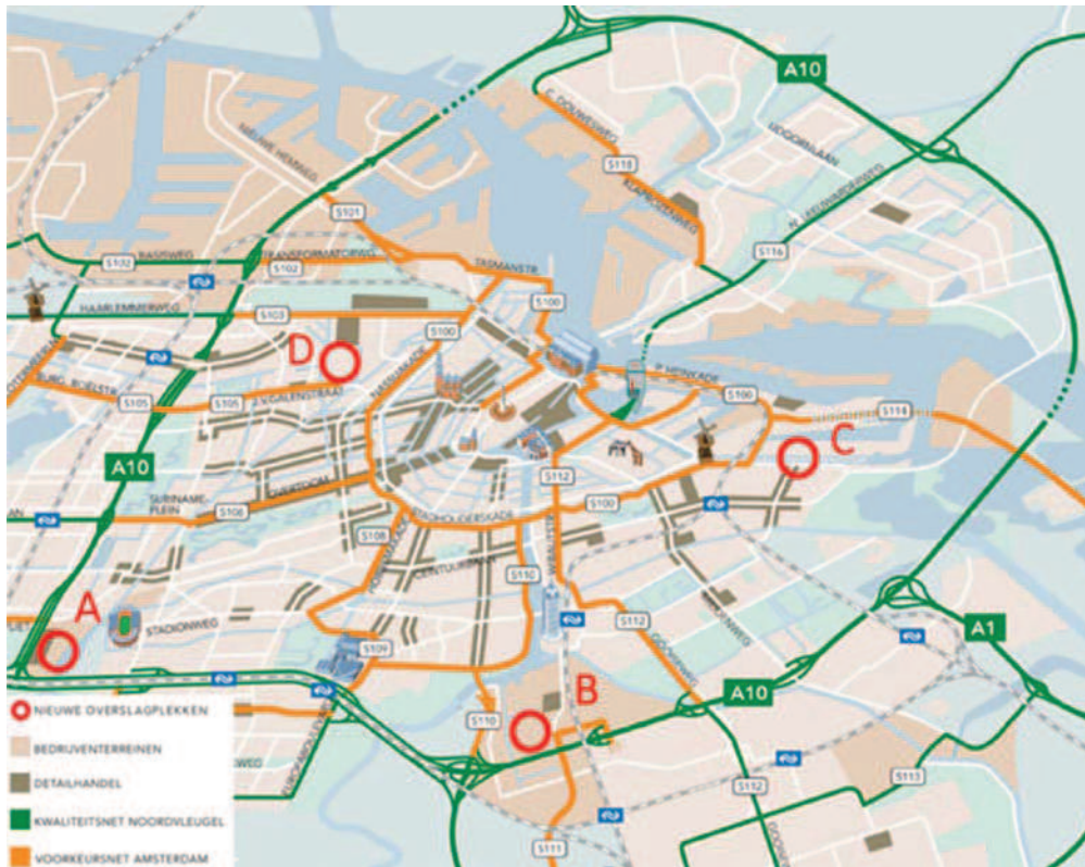
Figure 1. The inner-city of Amsterdam with the potential transshipment hubs (red circles) and their connecting roads (Municipality Amsterdam, 2015a).

To study this new concept the following research question is raised: