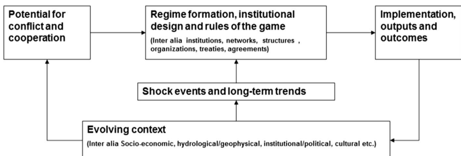
Fig. 1 Transboundary water regimes as a cyclic process, based on Mostert (2005)

Though a useful analytical construct, the concept of a cyclic process and successive stages represents of course a rather idealised notion of cross-border cooperation. In the real world, transboundary water management often takes an altogether different course: riparian countries may not come to the table at all to talk and negotiate. Moreover, once cooperative water regimes are formed, it is certainly not granted that cooperation is effective in terms of environmental problem-solving as international RBOs may become ‘paper tigers’ due to missing mandates or implementation of measures is stymied due to lack of resources (Zeitoun and Mirumachi 2008; Öjendal et al. 2013; Grey et al. 2016). Moving from one