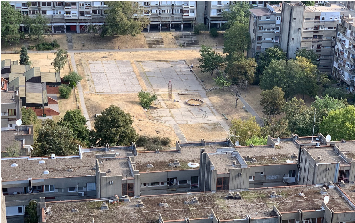
Figure 2. New Belgrade common spaces (Photography © Zorana Jovic, Student Workshop, Belgrade, 2020).