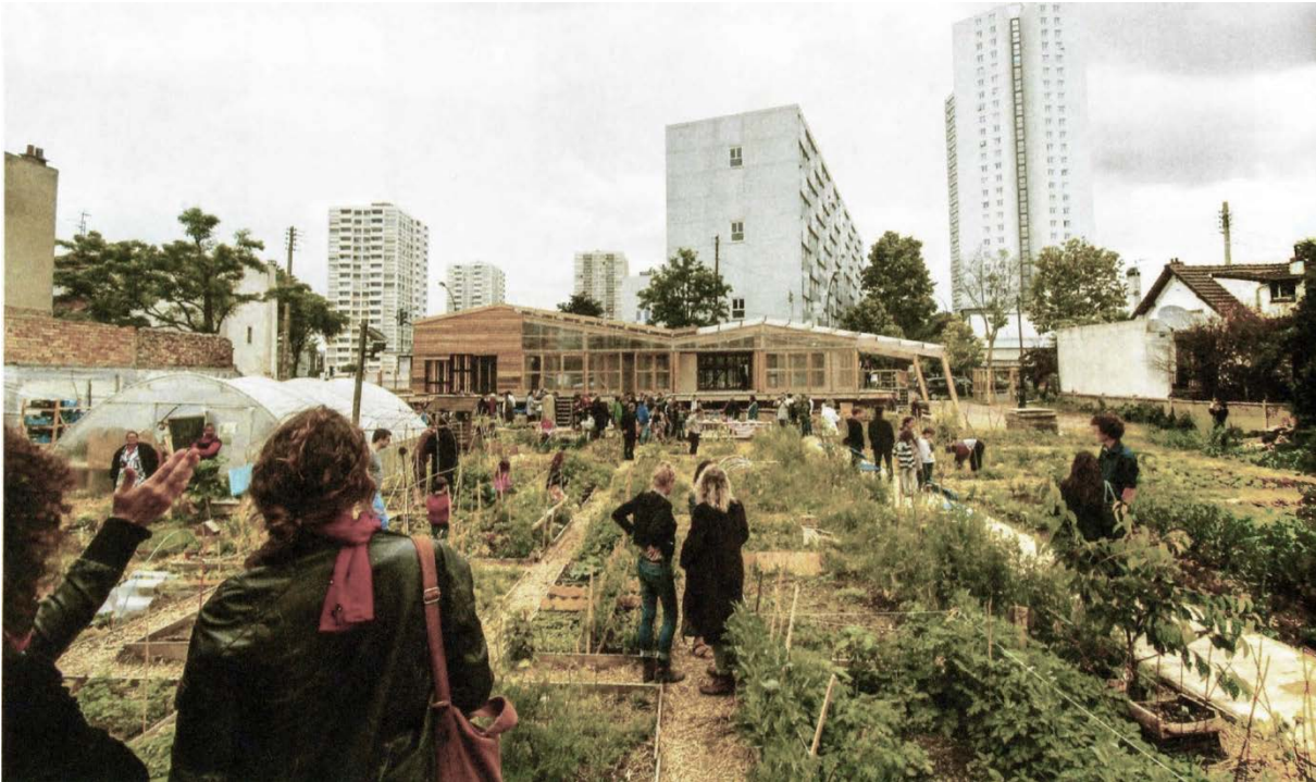
Figure 1. R-urban, AAA, 2008. (Photography © Andreas Lang, Source: Hiller et al., 2018)