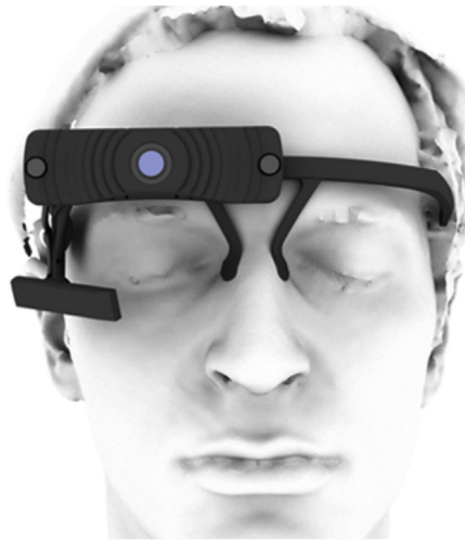
Fig. 1. The eye-tracker used in the present study.

Dijkstra, et al., 2012). Second, uncontrolled intersections were present in all routes travelled by the participants, providing us with sufficient data for the analysis. Our study focuses specifically on the glances to the right at uncontrolled intersections. This type of intersections requires cyclists to use their visual and auditory senses to check for the traffic approaching from the right - the direction to which cyclists should give way.