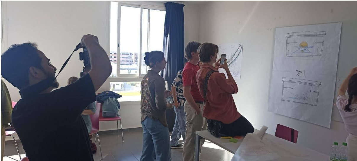
Capturing collective workshop results for further deliberations in Delft.

Modernistic beliefs and constructs. In the end, each team showcased their vision of a future where cities are harmoniously integrated with their water systems.