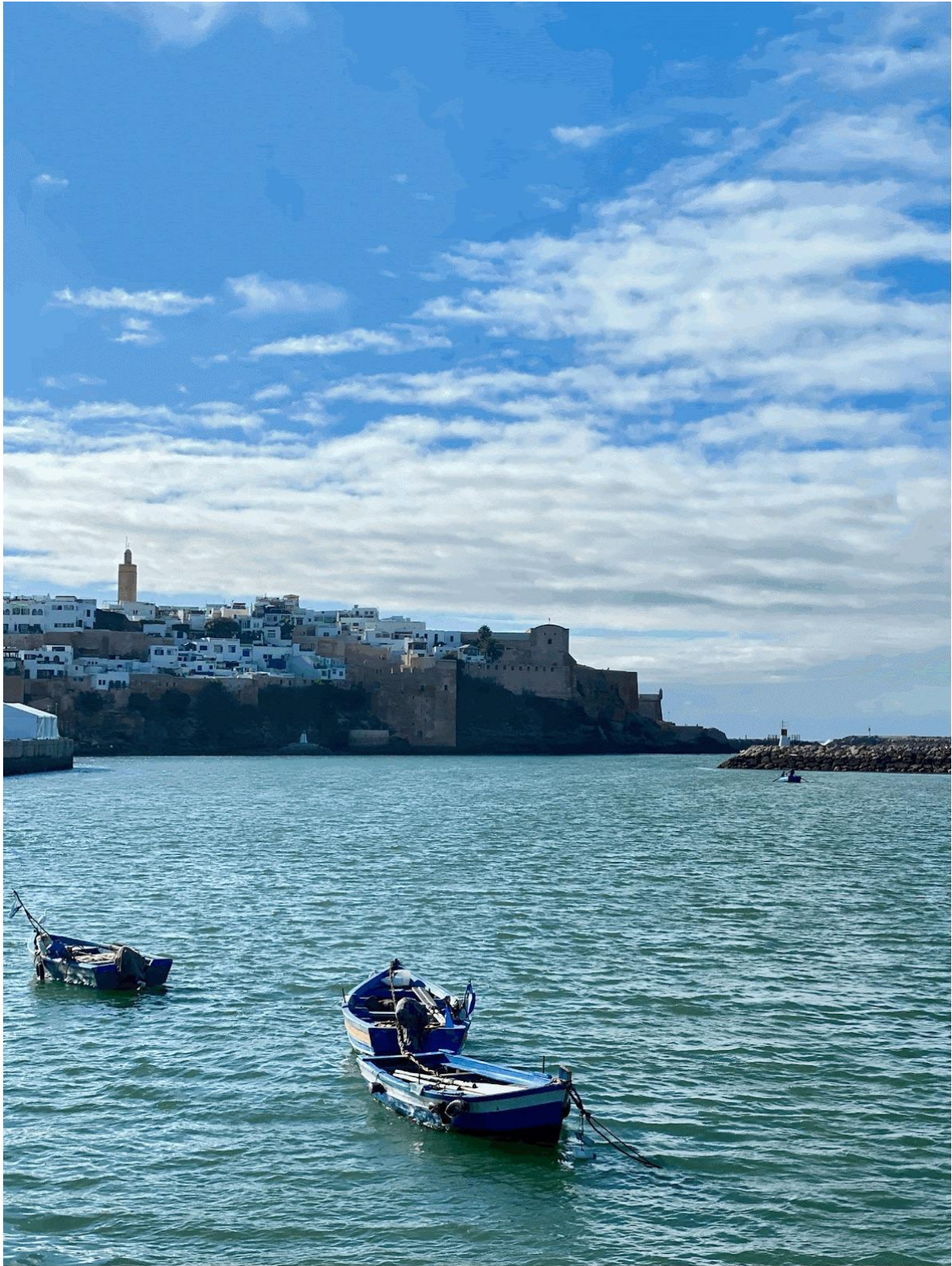
The Kasbah des Oudayas (Rabat) and the Bouregreg River, as seen from the public beach of Salé.

This year's Urban Archipelago graduate design course focuses on water and public space in Moroccan cities. We are building on and advancing the methods that we developed during last year's exploration of the Italian city of Trieste on the Adriatic coast, including, among others, biographies of place, micro-narratives, and guided imagery of water within urban landscapes. Once again we challenge students to rethink the spatial, societal, and cultural practices of today by learning from the past and envisioning