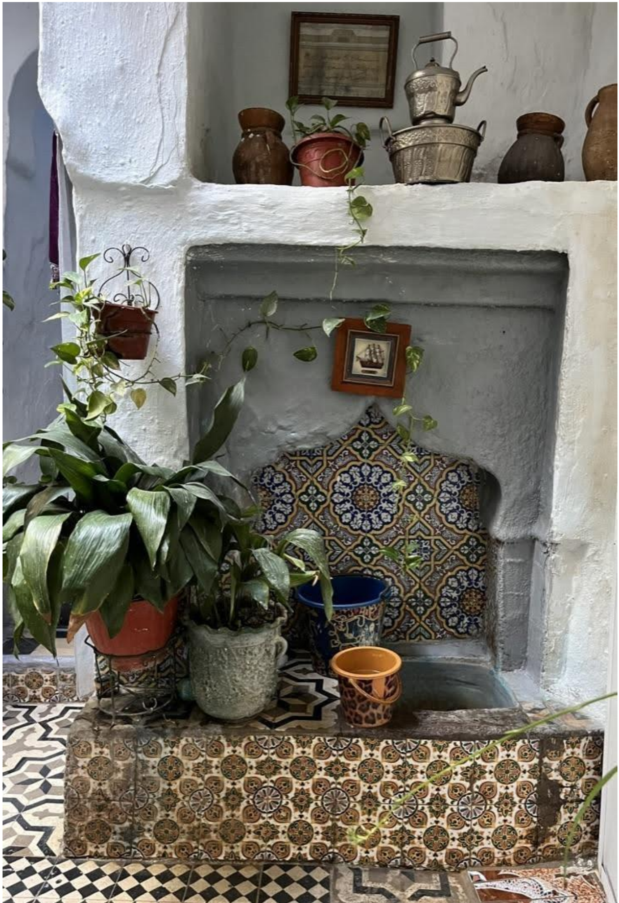
A typical hidden small-scale water well in Tétouan.