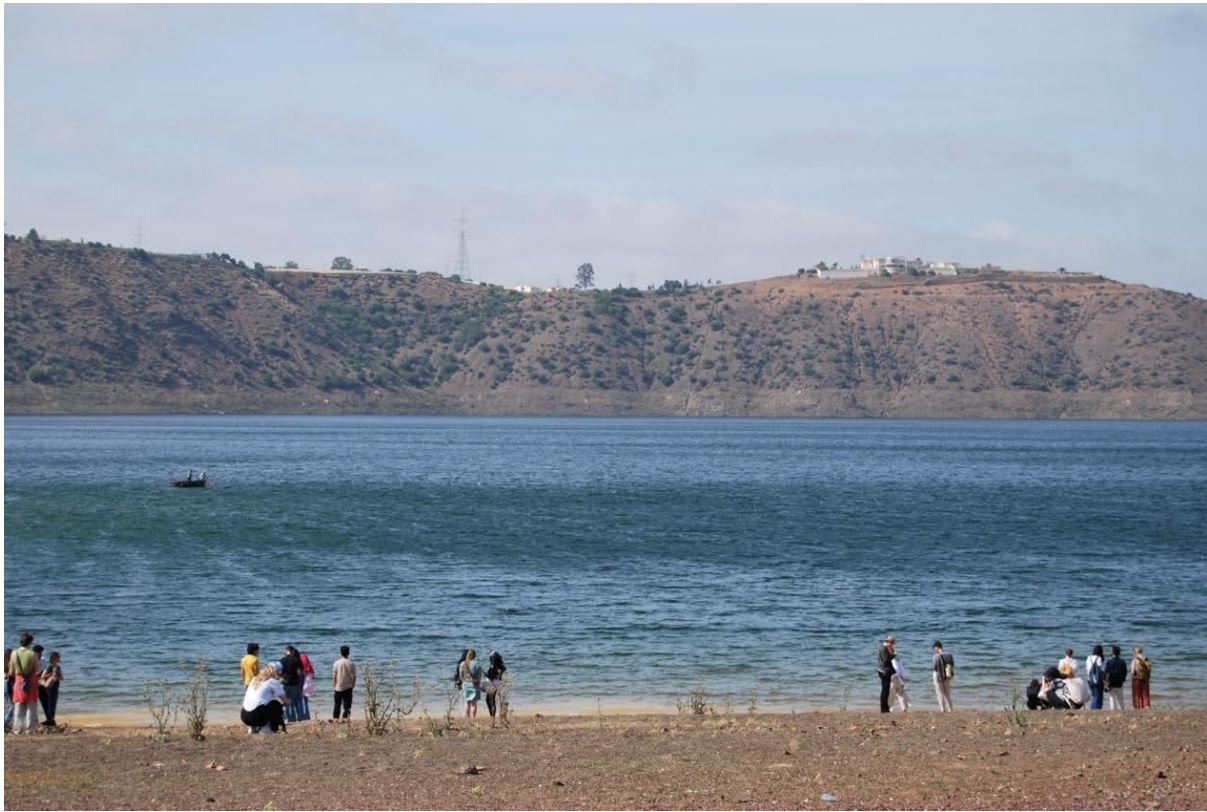
Informal gatherings along the Oued Mechra, located west of Rabat-Salé.

people at risk of social exclusion. The visit was followed by an afternoon dedicated to following the Bouregreg River upstream, studying the contextual materiality of the urban water systems and practices. We explored agricultural activities in the hinterland and infrastructural projects such as dams, reservoirs, sewage treatment plants, and waste management, along with traditional inland fishing activities, all of which shape the region's hydro-social conditions. These explorations highlighted the tensions between natural and modern systems, as well as between lavish and modest lifestyles.