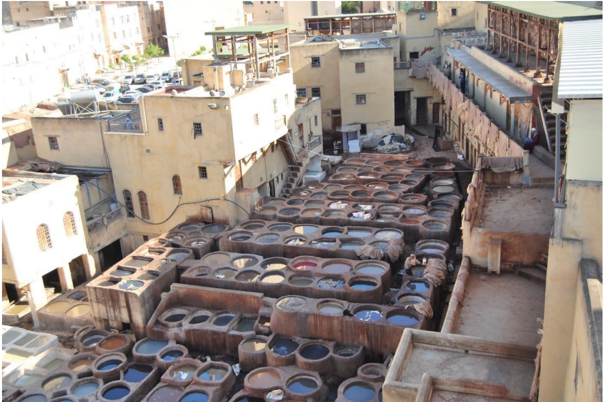
The Chouara Tannery of Fes el Bali, located along the Oued Fes (also known as the Boukhareb River).