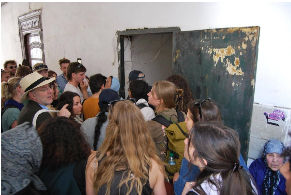
Public access to a Skundo cistern from the medina alleys in Tétouan.