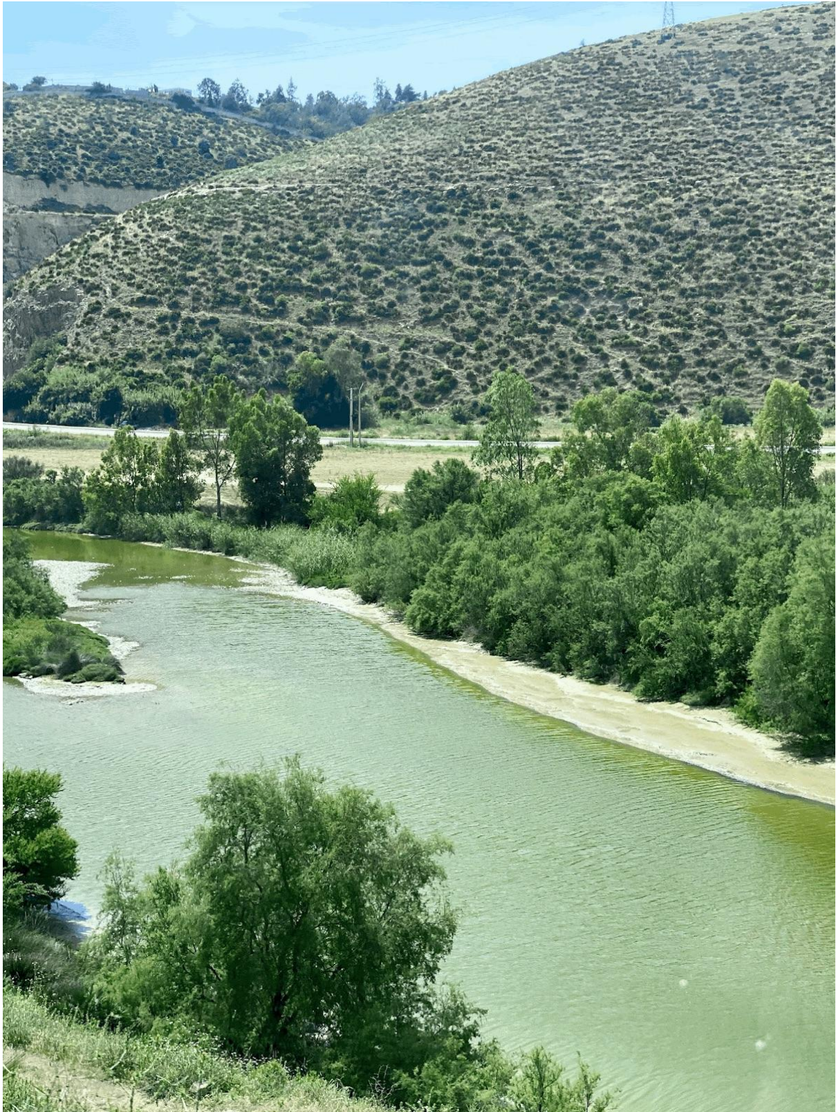
The serene inland banks of the Bouregreg River.

The group then boarded a bus to Azafran, an oasis on the banks of the Bouregreg River, where we were served lunch at the Med-O-Med Gardening School restaurant, near the city of Salé on the opposite bank facing Rabat. The group was introduced to the green premises, spanning over 8 hectares, dedicated to creating green public micro-climates and promoting propagating planting and irrigation techniques. The school provides opportunities for community development as well as education and training for young