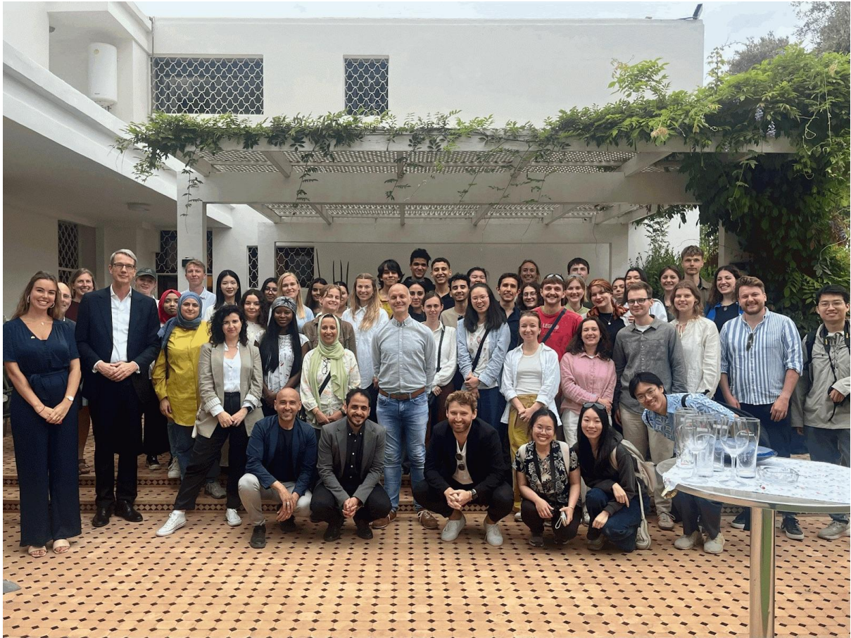
The TU Delft and ENA Rabat delegations at the Embassy of the Kingdom of the Netherlands in Morocco.

On the second day, we embarked on a journey to Fes, where the view from the Tombeaux Mérinides on the hills offered a perspective of the ancient city nestled in the valley. The sprawling urban tapestry is woven with the threads of its society and culture. The Oued Fes, or Fes river, naturally runs through the lowest part of the urbanized landscape. At some distance, southwest of the city, we saw Ras al-Ma, or “head of the water”, where the river springs. This fresh natural water runs first through the historical Royal Palace, with its main branch continuing through Fes el-Jdid before approaching Fes el-Bali. From this vantage point, the sharp separation between the new housing development and the medina was particularly remarkable.