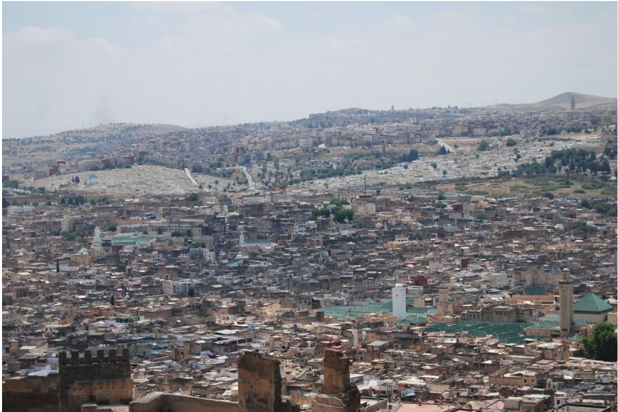
The intricate urban fabric of Fes, viewed from the Merinide Necropole.