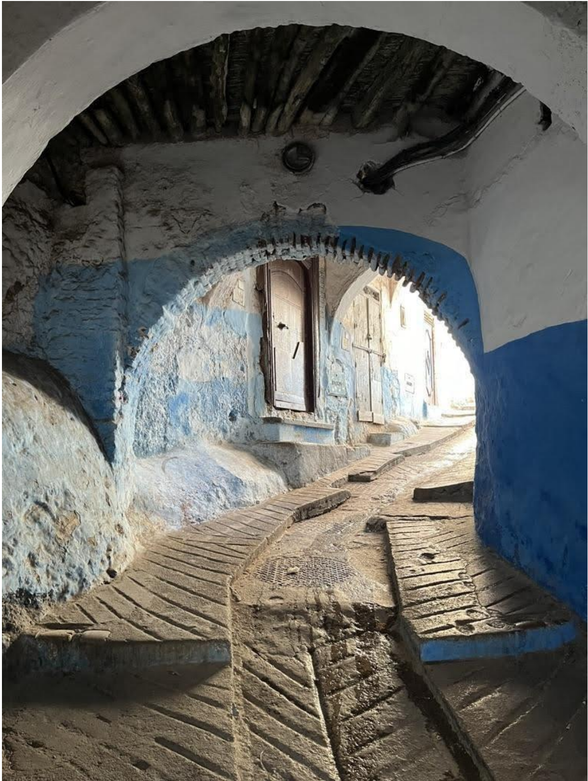
Tétouan's public space, featuring symbolic blue paint and surface drainage.

On the fourth day, a student design workshop, led by academic staff from both Delft and Rabat universities, took place at ENA, Rabat. This workshop aimed to foster a rich cultural exchange among students, analyzing the intricate relationships between land, sea, and river, as well as between water and culture. It focused on the diverse hydrological impacts on contemporary societies and territories, among others. Ouafa Messous emphasized the critical role of water in our world, particularly as climate change