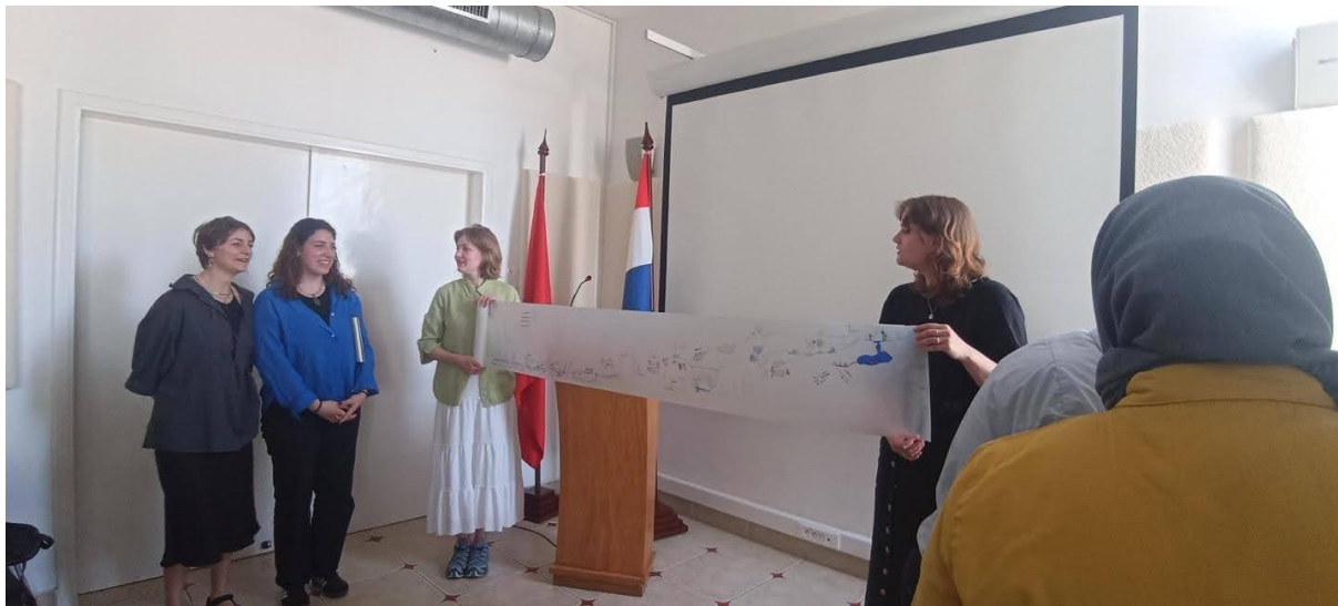
Students presenting their urban and territorial analyses of water in public spaces at NIMAR.

The program kicked off in Rabat amid appreciably higher temperatures, no rainfall, and relatively moderate humidity of 68%. The participating students from Delft University of Technology (TU Delft) arrived full of fascination and tentative viewpoints shaped by their pre-travel desktop research. They presented their concept ideas and received feedback from their hosts at the Netherlands Institute Morocco (NIMAR). The presentations sparked insightful discussions, enriched by the local perspectives of the Rabat students and the critical reviews from the international group of academic supervisors.