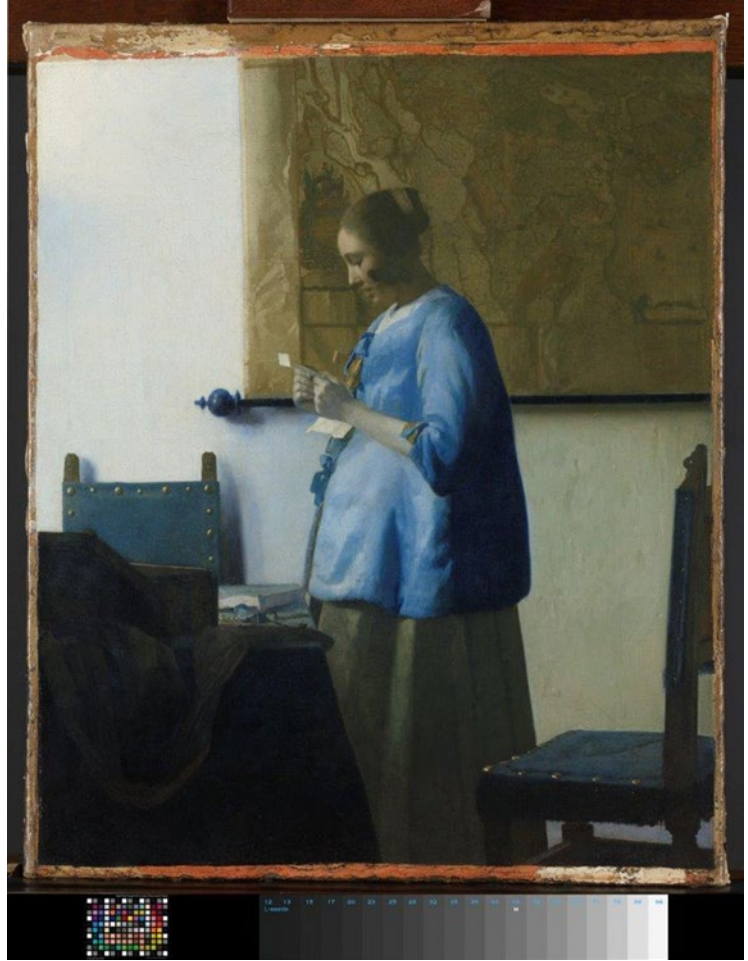
Figure 3 Johannes Vermeer, Letter-Reading Woman in Blue , ca. 1663–64.

woman who wrote to her husband in the East: “Bring me something really pretty and some cotton too, so I can show that my husband is an East India sailor” (Van Megan 2006: 37). 16