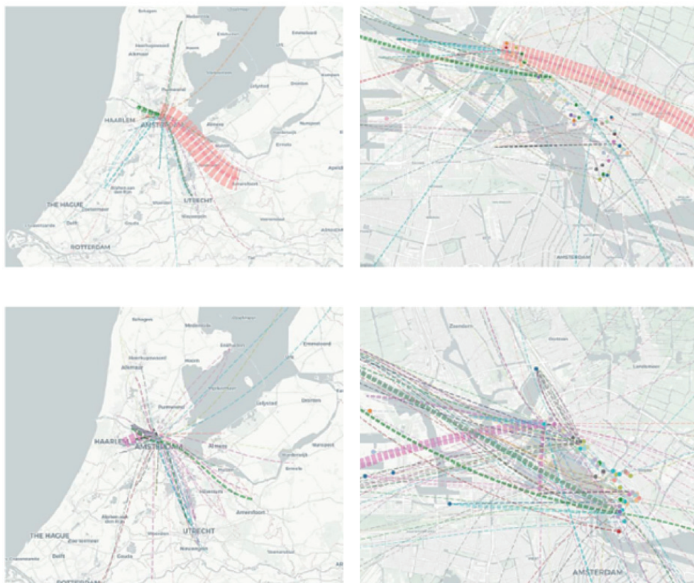
Fig. 3 Data and graphic Sileryte et al., 2020 (image out of scale)

the waste flow network of the construction sector alone exceeds not only the AMA but also the Netherlands, expanding across the country into several European countries and even beyond. For policymaking, this can be interpreted two-fold, either policy on CE have to be integrated at territorial governance level in which waste is travelling now, or policies and spatial plans need to facilitate the definition of optimal scales and amount of land necessary to develop CE strategies. The latter leads to the spatial questions, which role in the network of urban metabolism do the economic activities in one specific sub-area play, be it neighbourhood, district or municipality? The question of localisation of the economy is of particular interest considering the redevelopment of an