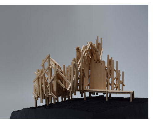
Figure 2 Proposed reed-based component, 1:1 prototype

Reed is an inconsistent material: each stem varies in diameter across its length making it challenging to work with in digital fabrication. Additionally, reed performs best when bundled to form a block or surface; combining many individually weak pieces to create a strong component. Bundling the reeds into compact, manageable components emerges as the logical approach to working with the material in a digital fabrication process. Mario Carpo argues the newly emerging alternative model for digital design is voxelization or discretization; architecture made up of fragments aggregated and informed by big data (Carpo, 2014). These discrete methods use Cartesian geometries that create surfaces through the combination of orthogonal blocks, or voxels, capable of forming curvilinear space through adjusting their size and arrangement (Garcia, 2019). This methodology provides the basis for a proposed system of bundled reed components.