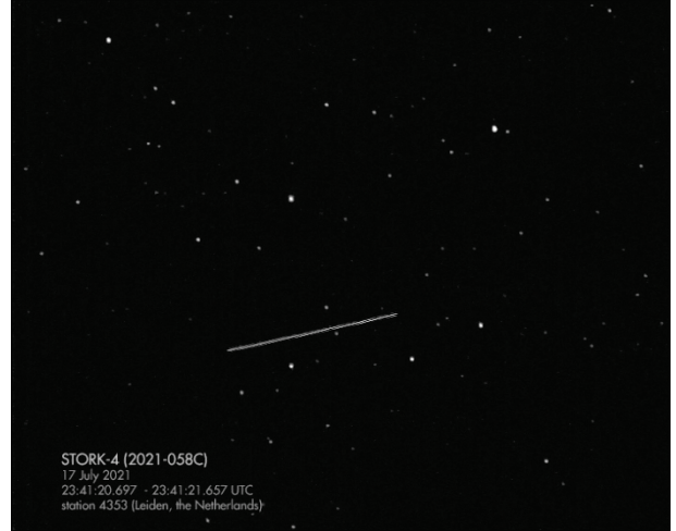
Figure 3. Video capture of a 3U Cubesat: the Stork 4 satellite (2021-058C) imaged at a range of 552 km on 17 July 2021 by station 4353 in Leiden, the Netherlands. Stack of 25 frames obtained with a WATEC 902H2 Supreme (see fig. 1). The camera was fitted with a Samyang 2.0/135 mm lens for the occasion.

30'' to 5''. For an object observed at a range of 500 km, this corresponds to positional accuracies in the order of ~75 to ~15 meter. As the actual positional accuracy is not only dependent on astrometric accuracy but also on timing accuracy, a GPS- or NTP-based timing accuracy of 0.001 to 0.01 second introduces an extra inaccuracy in the order of 10-100 meters.