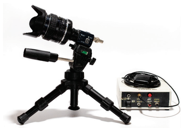
Figure 1. Example (A) of a camera system used by ISO’s: the camera setup of station 4353 in Leiden, the Netherlands, operated by M. Langbroek. This is a WATEC 902H2 Supreme Low Light Level CCTV camera, with time management by GPSBoxsprite-2 GPS time inserter. The lens shown is a Pentax 1.2/50 mm lens, but a Samyang 1.4/85 mm and a Samyang 2.0/135 mm lens are used as well..

Example A in fig. 1, the setup operated by station 4353 (Marco Langbroek, Leiden, the Netherlands), consists of a sensitive WATEC 902H2 Supreme Low-Light-Level CCTV camera, which can be equipped with a variety of photographic lenses. The author uses this camera with (depending on the type of target) either a 1.2/50 mm Pentax, a 1.4/85 mm Samyang, or a 2.0/135 mm Samyang lens. These lenses provide a field of view of respectively 7.4 \times 5.5 degrees (50 mm), 4.4 \times 3.3 degrees (85 mm), and 2.7 \times 2.0 degrees (135 mm).