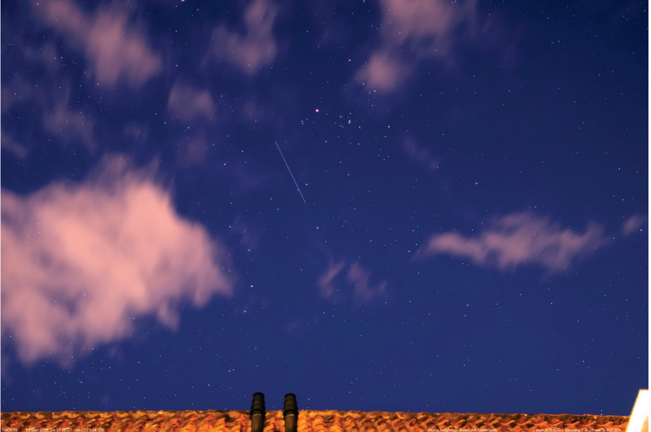
Fig 5: USA 338, the NROL-91 payload, imaged in a partly cloudy sky on its fourth revolution, six hours after launch, on 25 September 2023 between 04:17:20.02 – 04:17:25.02 UTC by Marco Langbroek from Leiden, the Netherlands, using a Canon EOS 80D DSLR and Samyang 1.4/35 mm lens. USA 338 has created a trail in this 5-second exposure at 800 ISO.

Fig. 5 shows one of the photographic captures obtained from Leiden, the Netherlands. The object's sky track was close to predictions based on the pre-launch orbit estimate. Continued optical and radio tracking by several observers over the consequent days established it in a 396 x 416 km, 73.5 degrees inclined orbit.