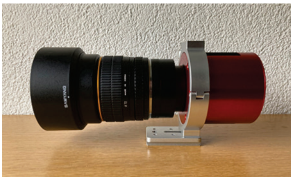
Figure 2. Example (B) of a camera system used by ISO's: the camera setup of station 4171 in Dwingeloo, the Netherlands, operated by C. Bassa. This is a ZWO ASI 1600MM PRO CMOS camera, fitted with a Samyang 1.4/85 mm lens.

Depending on what camera-lens combination is used, the astrometric accuracy of these systems is in the order of