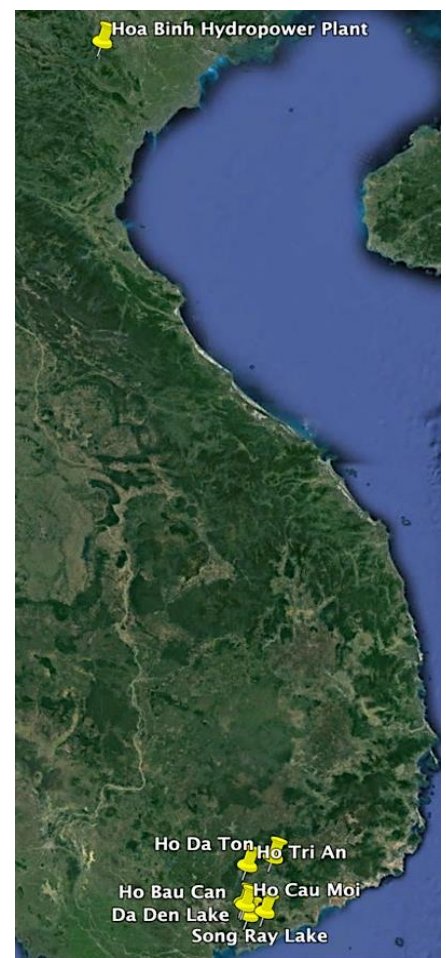
Figure 3. Selected reservoirs in this study. A hydropower reservoir in the north and six irrigation reservoirs in the south.

farmlands and shift reliance on rain-fed agriculture to managed and efficient agricultural practices. Deploying FPVs decentralizes the energy system and makes it more resilient; moreover, it helps sustainable management of Vietnam's vast water resources, particularly through diversifying investments in infrastructure for the water sector and deepening public participation.