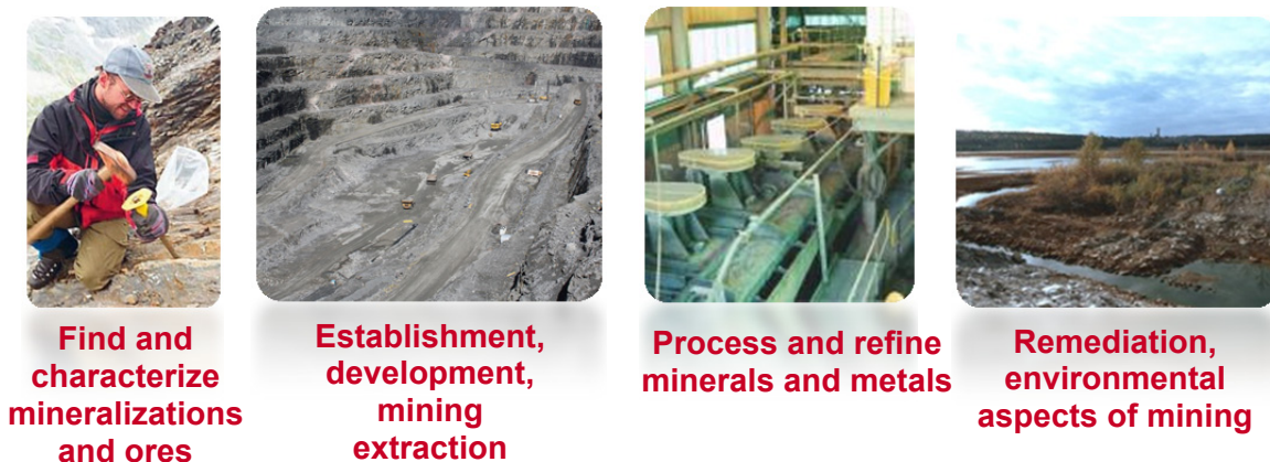
Figure 2. Stages in the life of mine.

The raw material chain can be subdivided into primary (exploration, extraction, mineral processing and metallurgy) and secondary (recycling and material substitution) resources. The main thematic content in this project is primary resources where the stages in the life of a mine are expressed in Figure 2. The exploration phase can be subdivided into reconnaissance and detailed exploration where each of these steps takes between one and five years. Hence often the establishment of a mine does not start until three to eight years after finding a mineralization. The development work, which often takes two to five years, concerns mining rights, financing, roads and transport systems, surface plants, shafts etc. The mining production, which is a process itself, needs to last more than 10-30 years in order to be economically sustainable. The final stage, which often takes one to ten years, is mine closure and restoring the mining area to an acceptable state of safety and environment. In each stage in the life of a mine it is important to simultaneously be aware of all the other stages in order to be an entrepreneurial and innovative engineer.