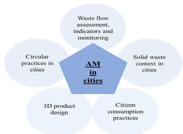
Fig. 2. Five areas of knowledge emerging from the literature review regarding AM.

Life cycle assessment, monetary material flow or material flow analysis provide insights through the supply chain putting emphasis on a specific system flow (Cottafava et al., 2019; Neo et al., 2021; Tangwanichagapong et al., 2020). Life cycle assessment is used to assess material flows for the reuse of end-life plastics (Neo et al., 2021). Monetary material flow was used to integrate new business models and economic incentives into the