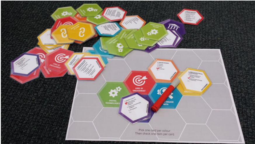
Fig. 1.1 The game cards set