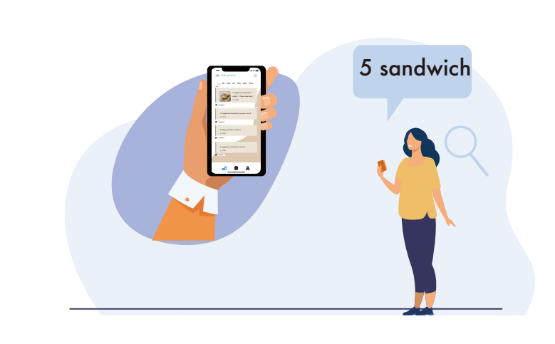
5. After the meeting, the orderer or the conference organizer will send the left food information to the App at different faculties.