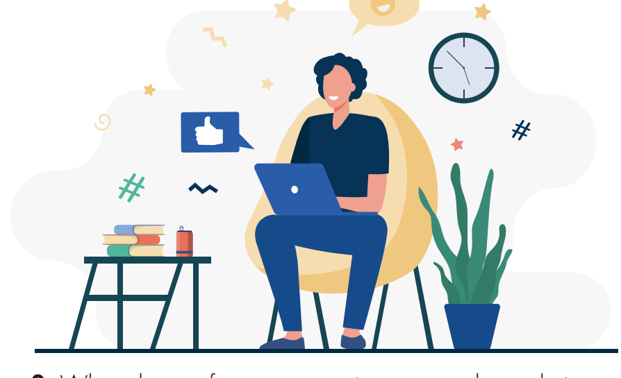
2. When the conference organizer opens the website, they could download the conference food form to write the meeting information and send it to the orderer.

tips for booking the food on the website written by other orderers to take the reference of it.