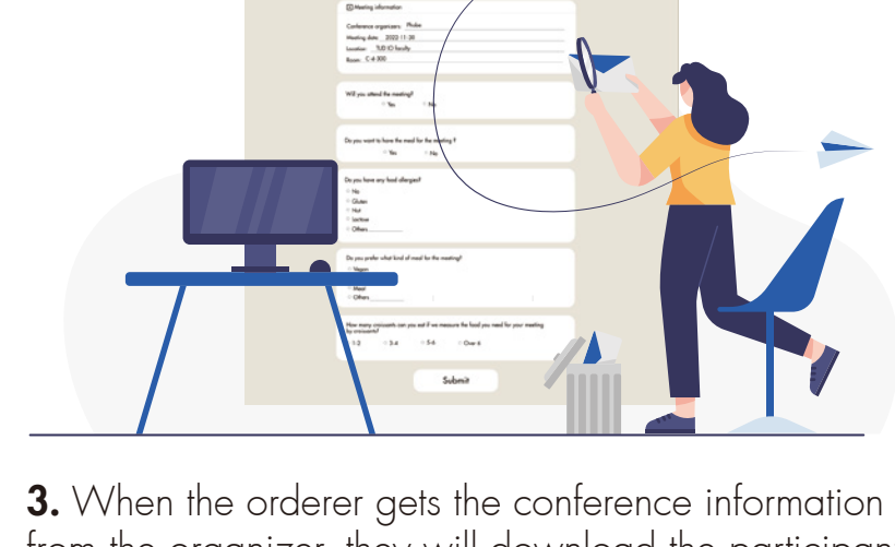
3. When the orderer gets the conference information from the organizer, they will download the participant card and send it to the audience to fill it in.