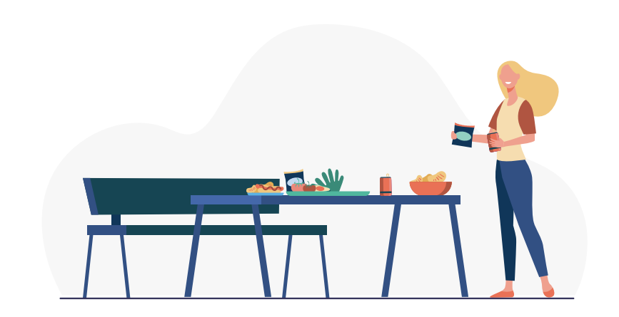
6. The students will receive the notification of the food message from the App and go to the specific position to take the food.