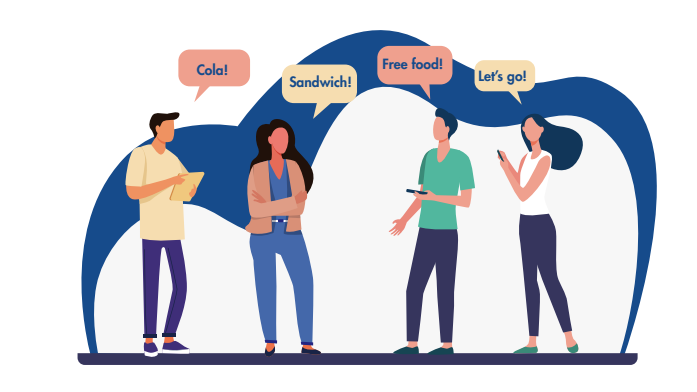
7. Students could pack the food with the provided package or take it to eat.