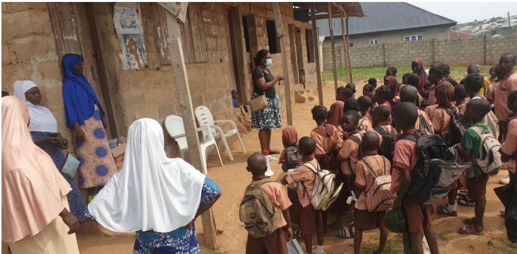
Urine sample collection process at the schools located in Ajoofeebo community. A patient with one of the NTD diseases. Lymphatic Filariasis or Oncho is suspected.