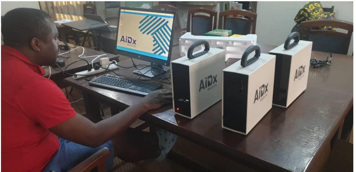
AiDx system setup and training of expert Laboratory scientist who performed the examination