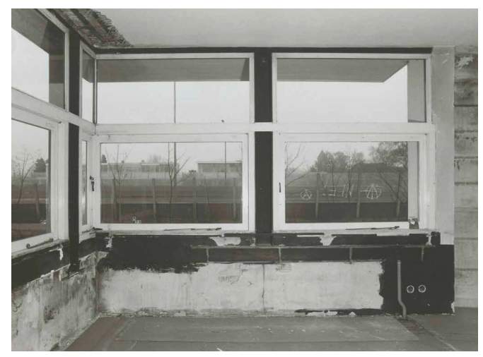
\mathsf{FIG.~3.4} \; The corner window during the restoration, with a view of the viaduct and the houses on Erasmuslaan

The most visible and radical aspect of the restoration of the upper floor was the stripping of the walls and ceiling, the elements that were so crucial to the spatial picture [FIG. 3.3/3.4]. Stripped back they revealed only 'bare brickwork' and a bare soffit [FIG. 3.5/3.6/3.7]. 'The f[oundation] and I were of the opinion that we would only be able to make the original spatial picture clearly and definitely tangible if the delimiting surfaces that determine that picture were once more of impeccable texture and colour,' Mulder later wrote. Even the possible withdrawal of the RDMZ's grant did not persuade the foundation to change its mind according to Mulder.<sup>23</sup> In 2016 Mulder still recalled a visit to his office by Ida van Zijl and Wim Denslagen. There was further discussion of the rigorous approach, which according to Denslagen did not correspond to what RDMZ was used to. Mulder explained once more that for him the original spatial experience went hand in hand with the restoration of space and surfaces. 'Denslagen disappeared, and that was the end of it'.24 And so Mulder proceeded to reprise the reconstructive approach he had previously applied to the exterior.