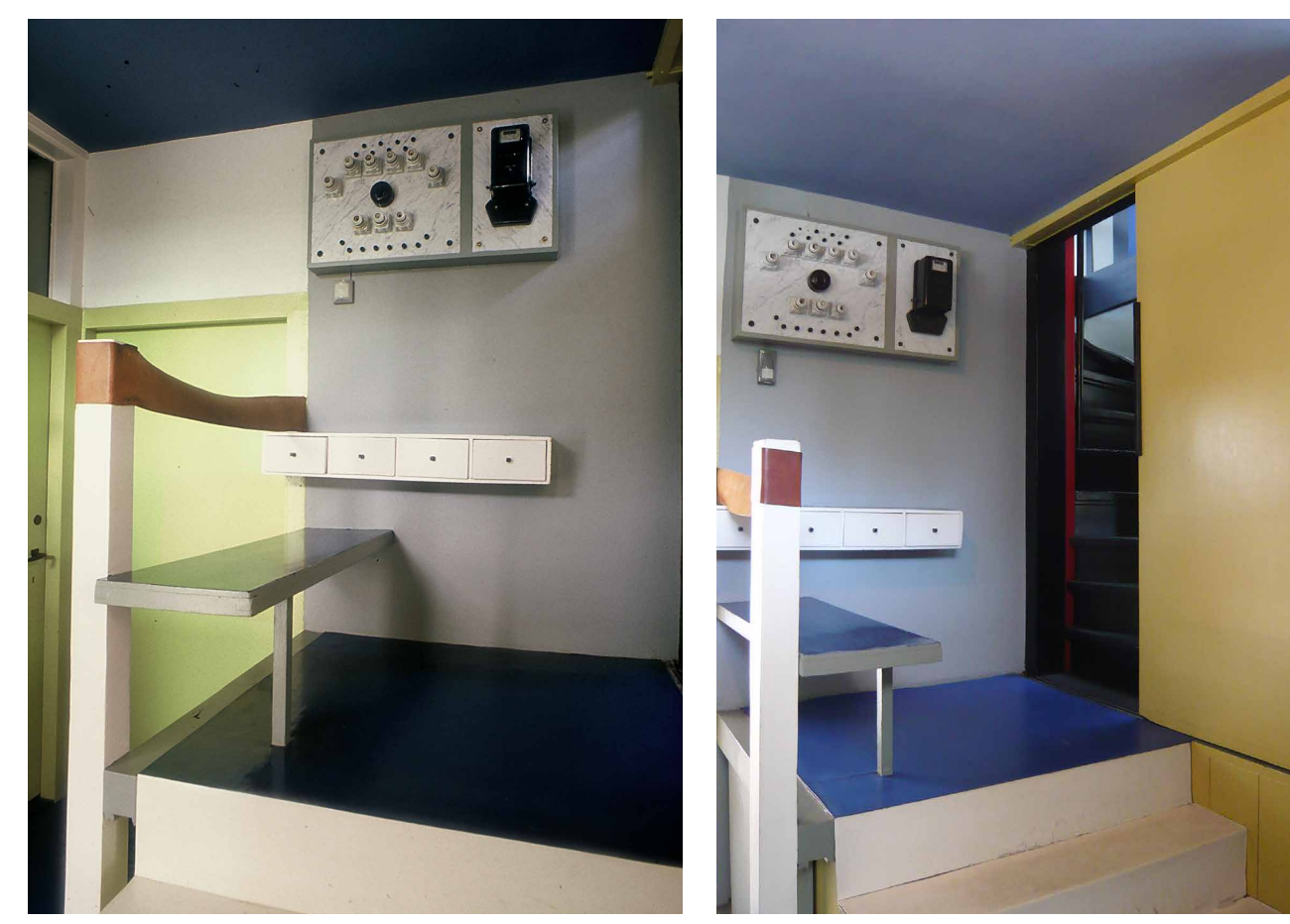
FIG. 3.11 Hall, 1985