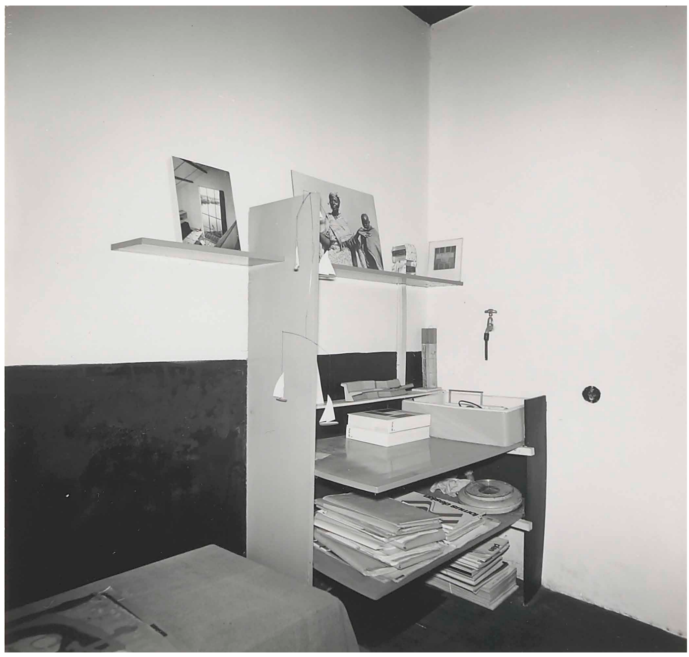
FIG. 3.16 The study painted in white, black and shades of grey, c. 1974