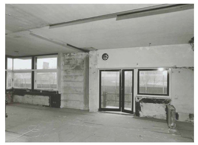
FIG. 3.3 The partially dismantled upper floor