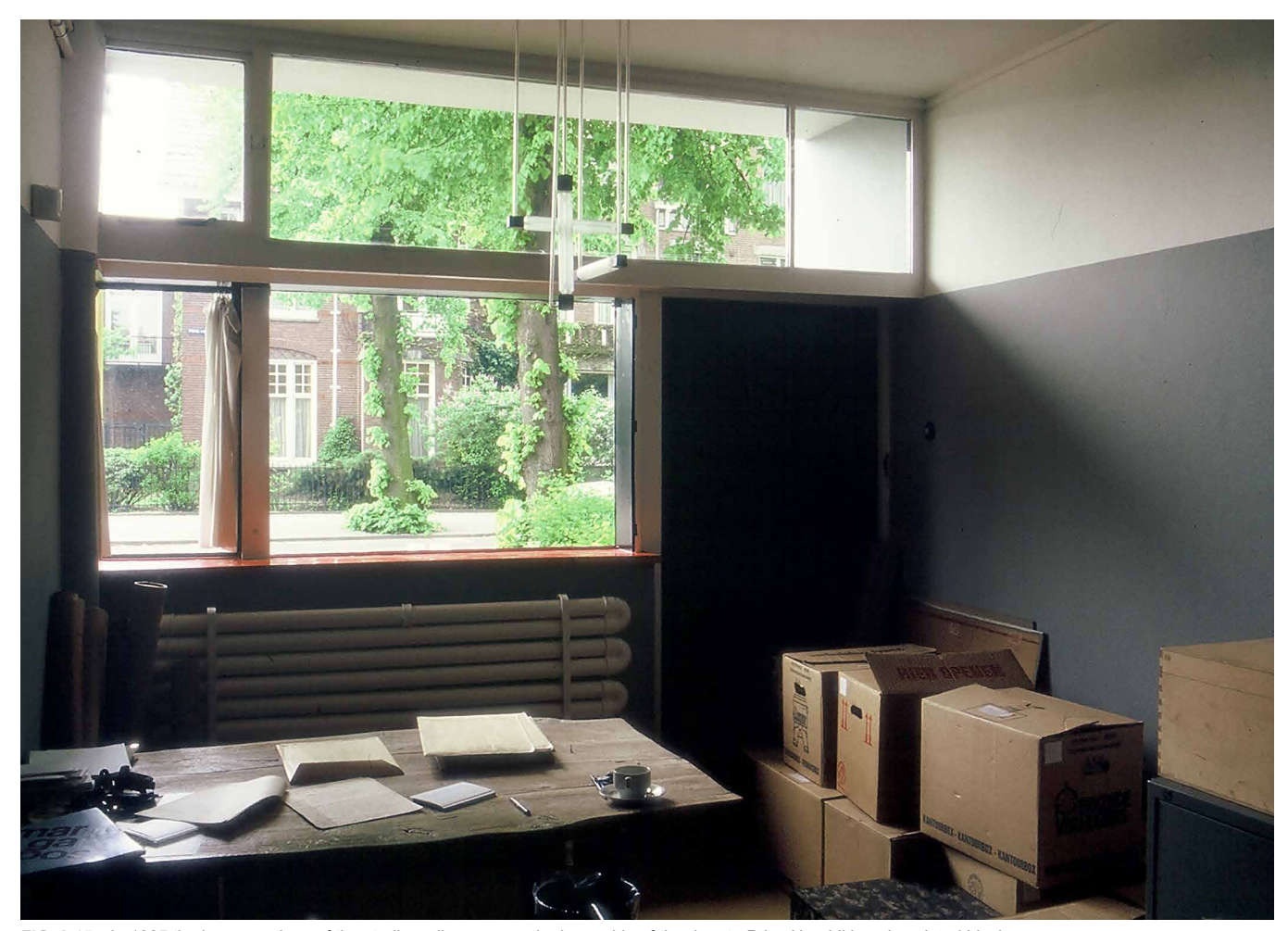
FIG. 3.15 In 1985 the lower sections of the studio walls are grey; the inner side of the door to Prins Hendriklaan is painted black

However, a photo taken in April 1985 shows the lower sections of the walls painted grey, and the inside of the door onto Prins Hendriklaan in black rather than white [FIG. 3.15]. Upon inquiry Mulder recalled that he had based the colour scheme of the ground floor on what he had encountered there.<sup>40</sup> The studio was therefore repainted in the colours of the top coat, without searching for traces of the original colours and also without