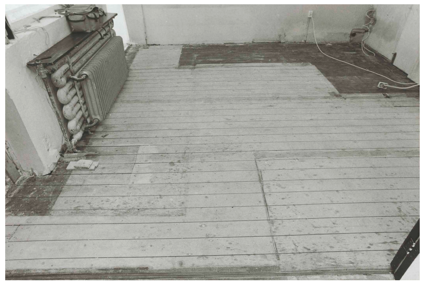
FIG. 3.2 The floor gave an indication of the division of the floor surface and the position of the beds

The survey of the now stripped-back house yielded a lot of new information [FIG. 3.1].<sup>21</sup> For example, pencilled lines and painted and stained areas were discovered on the floors, which provided insight into the division of the floor surface and the position and size of the beds [FIG. 3.2]. Holes in the walls indicated where cupboards and other items of furniture had been fixed to the walls. Mulder also recovered original parts of the former kitchen. And during the inspection of the electrical services, a 'strangely insulated hot water system' was discovered under the floor.