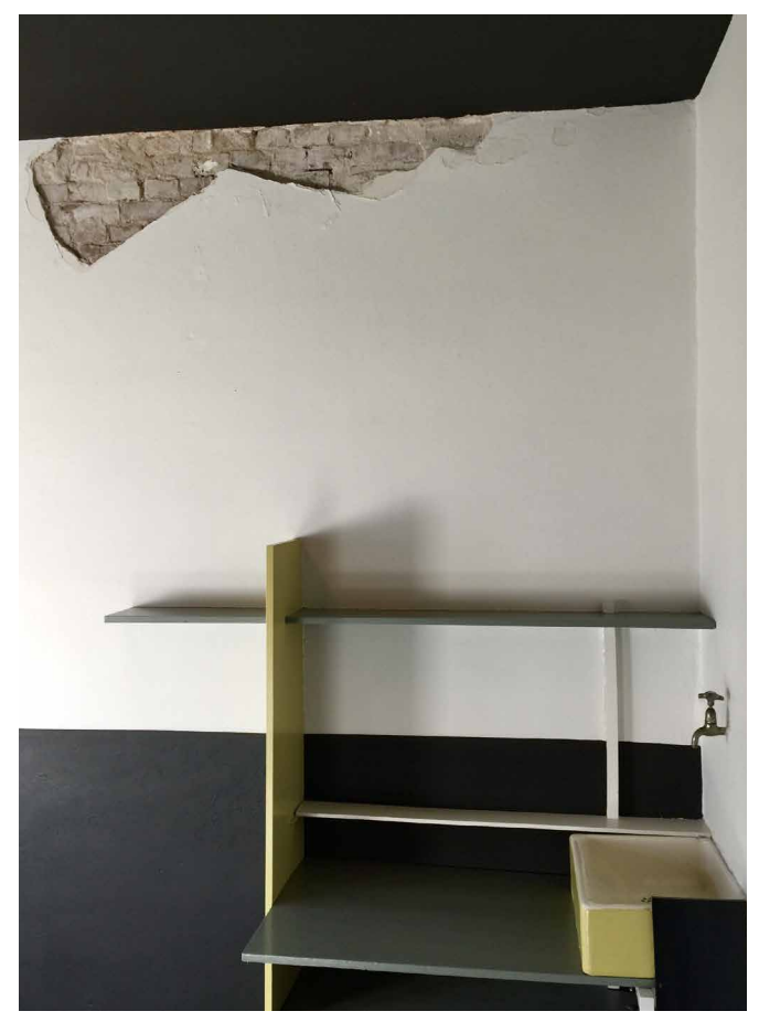
FIG. 3.13 The plasterwork at the top of the south wall of the study was damaged and came loose in October 2016

Most of the illustrations in Het Rietveld Schröderhuis were of this floor, plus one or two photographs of the reconstructed kitchen or freshly painted hall on the ground floor. If we compare the hall in its current state with a photograph taken in 1985, immediately after Truus Schröder's death, the differences in colour are obvious [FIG. 3.11/3.12]. The architect repeatedly stressed that everything in the interior was created by him, that he had stripped the inner surface of the walls back to the structural shell, and