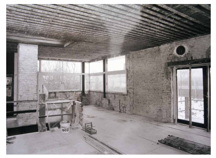
FIG. 3.5 The upper floor of the Rietveld Schröder House in dismantled state

Before the walls were replastered, the cracks in the brickwork were, like those in the exterior, filled with synthetic mortar. The new metal lath ceiling was suspended from the joists using a (floating) steel network in order to minimize the chance of cracks.<sup>27</sup> The plastering was carried out by the firm of H. van de Kant Afbouwbedrijf Zeist B.V. H. van de Kant recalled that the existing plaster had to be carefully removed and placed in bags in plastic trays, sorted according to wall area and colour. This enabled Mulder to carefully examine the plaster and layers of paint on top of it.<sup>28</sup> After that examination the old plaster was carried away and destroyed. Although the abovementioned memos from 1984 and 1985 refer to a specific plaster mix, Mulder and Van de Kant stated, when asked, that the exact proportions of cement, sand and lime were decided on site. Ultimately, it was the plasterer who determined this, just as in Rietveld's day. After applying the plaster, the plasterers had to sand the base coat 'with jute on a wooden board', to achieve the same effect as under Rietveld. It resulted in a smooth surface with here and there a stray grain of sand, but without any traces of repair work or restoration.