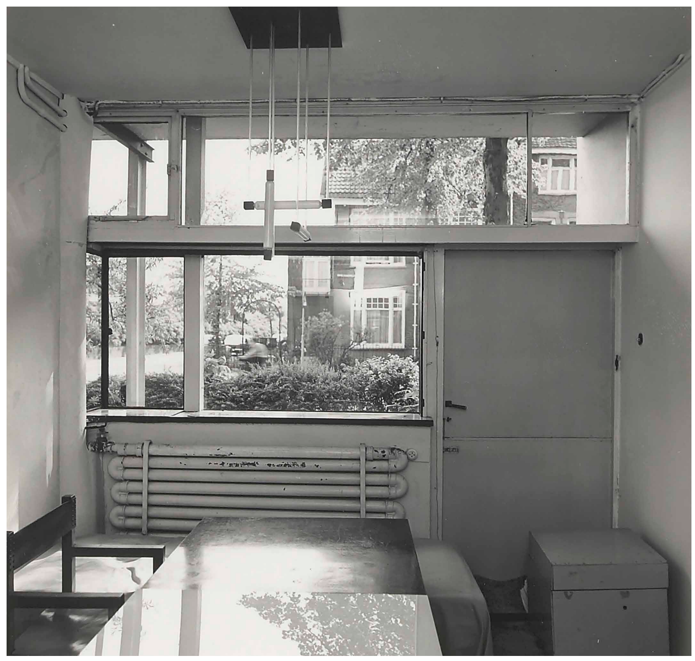
FIG. 3.14 Undated photograph of the studio with view of Prins Hendriklaan; predominantly white colour scheme