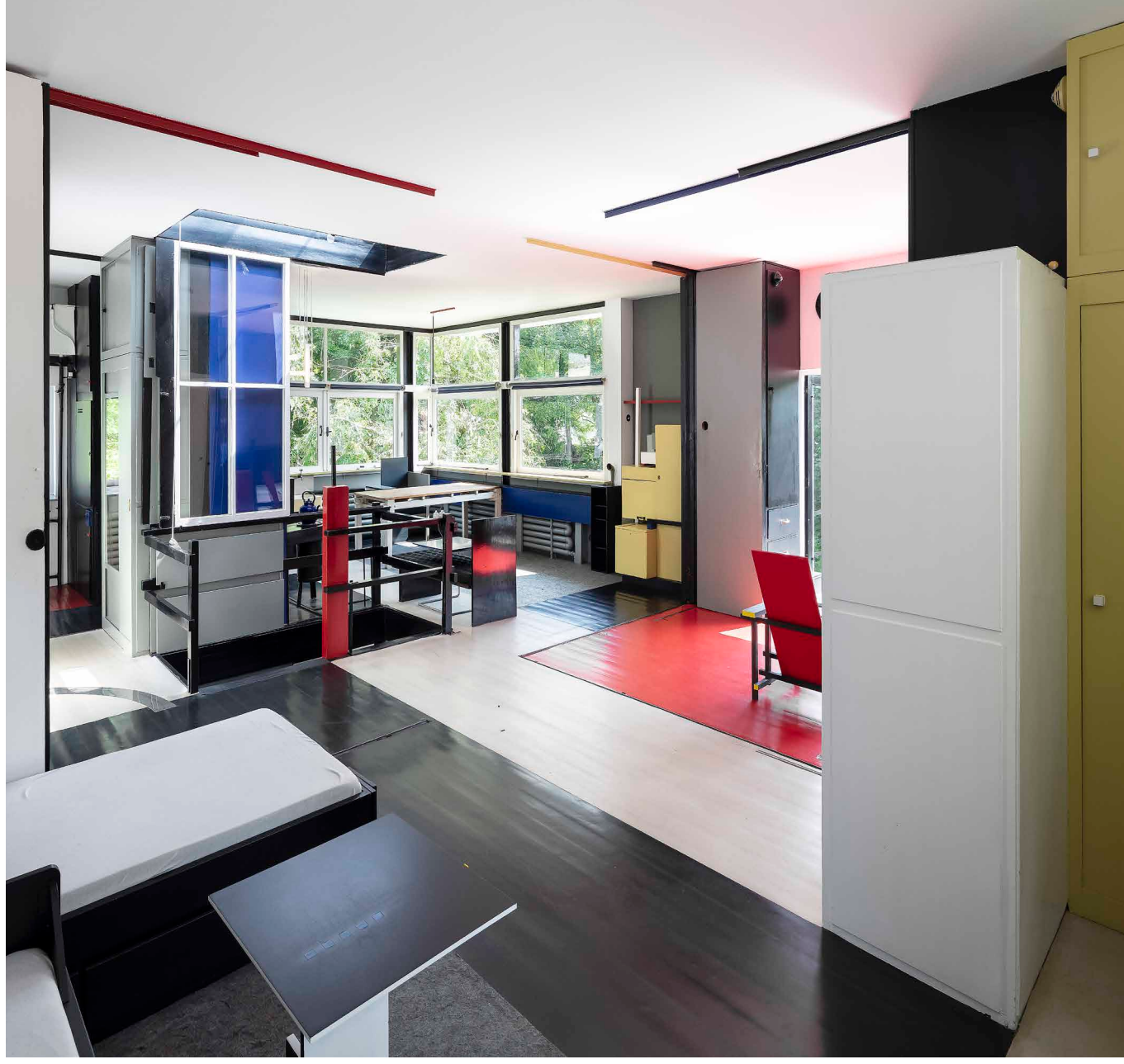
FIG. 3.10 The colour composition of the upper floor, 2018