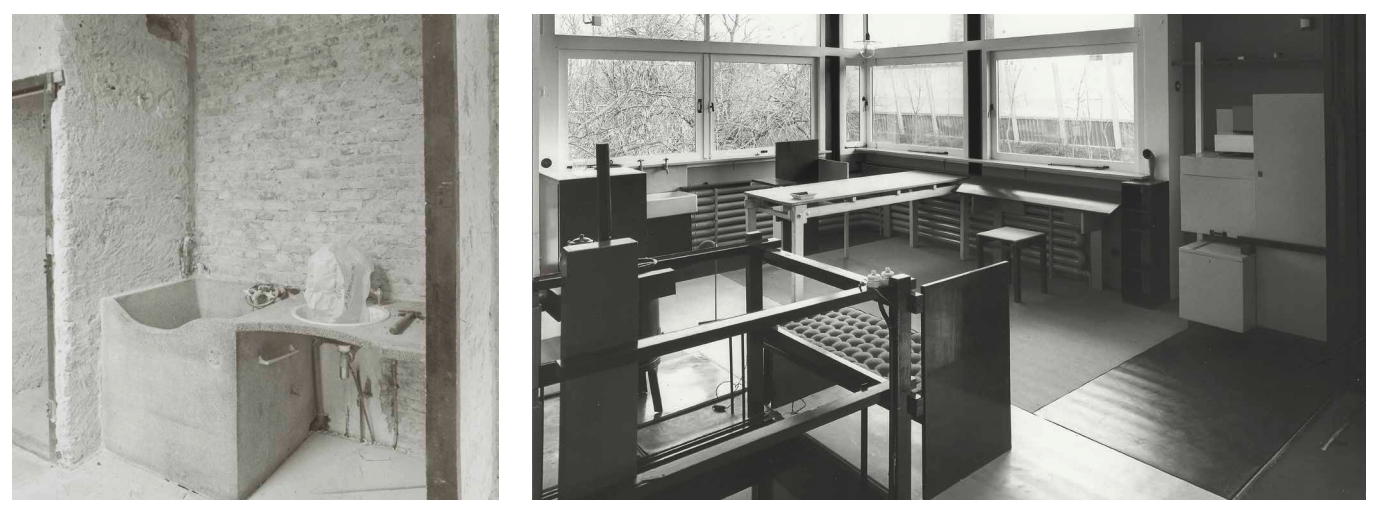
FIG. 3.7 Stripped bathroom with 'lavette'