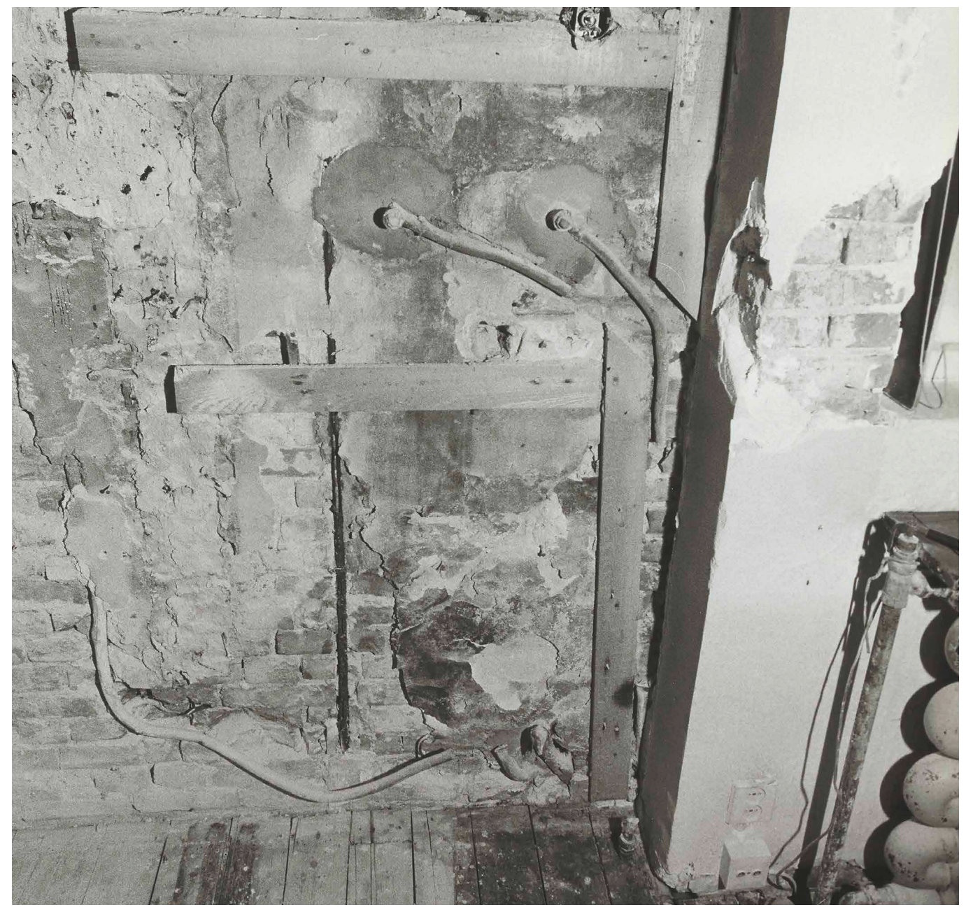
FIG. 3.1 The dismantling of wall, floors and ceiling yielded a lot of information about pipes, connection points and the attachment of furniture