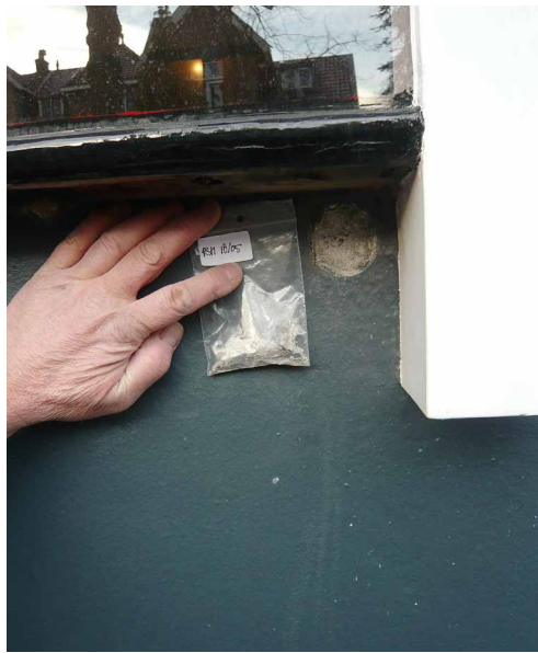
FIG. 3.18 SRAL specialist taking a sample from the east wall of the studio