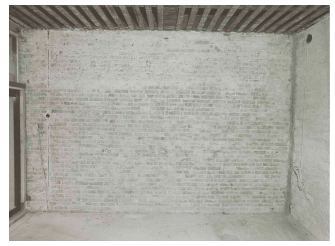
FIG. 3.6 Bare brick wall and stripped ceiling

Before the walls were replastered, the cracks in the brickwork were, like those in the exterior, filled with synthetic mortar. The new metal lath ceiling was suspended from the joists using a (floating) steel network in order to minimize the chance of cracks.<sup>27</sup> The plastering was carried out by the firm of H. van de Kant Afbouwbedrijf Zeist B.V. H. van de Kant recalled that the existing plaster had to be carefully removed and placed in bags in plastic trays, sorted according to wall area and colour. This enabled Mulder to carefully examine the plaster and layers of paint on top of it.<sup>28</sup> After that examination the old plaster was carried away and destroyed. Although the abovementioned memos from 1984 and 1985 refer to a specific plaster mix, Mulder and Van de Kant stated, when asked, that the exact proportions of cement, sand and lime were decided on site. Ultimately, it was the plasterer who determined this, just as in Rietveld's day. After applying the plaster, the plasterers had to sand the base coat 'with jute on a wooden board', to achieve the same effect as under Rietveld. It resulted in a smooth surface with here and there a stray grain of sand, but without any traces of repair work or restoration.