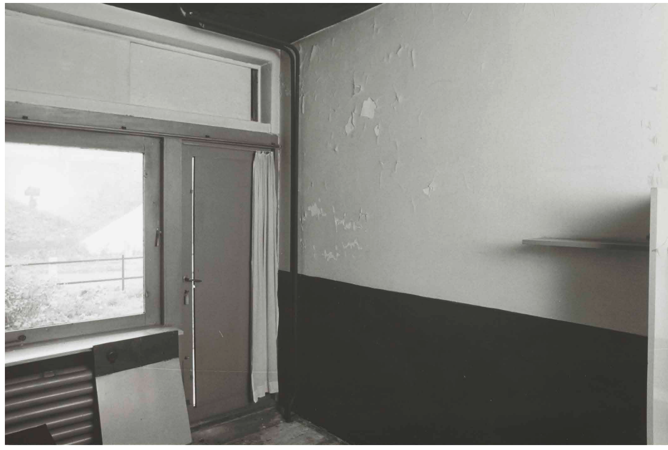
FIG. 3.17 Undated photograph of the study

In Mulder's view the ground floor, with its rather traditional layout, was not so crucial to the value of the architecture. The layout had been necessary in order to obtain planning approval (in 1924), but it contributed little to the spatial picture, which was all-important for the house. This was why he treated the ground floor differently from the upper floor. The walls and ceiling were not dismantled, just repaired, with visible repairs being tolerated.<sup>41</sup> In 2018, in order to verify this, TNO and the Stichting Restauratie Atelier Limburg (Foundation Restauration Atelier Limburg/SRAL)