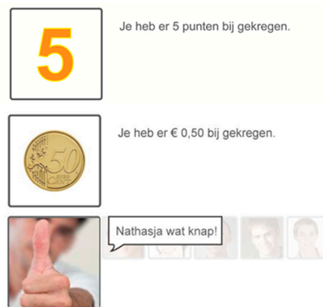
Figure 2. Examples of three types of rewards (translation from top to bottom: “You earned 5 more points”, “You earned 50 more Eurocents”, “Natasha, how smart!”).