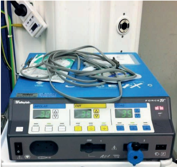
Figure 1. Electro-surgical device and current sensor (encircled).