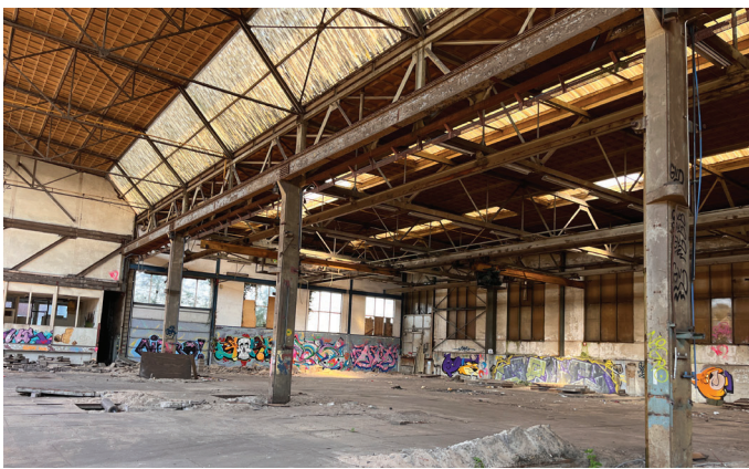
Figure 12: Image of the interior of Kloos, with graffiti on the wall.

All the characteristics of the former Kloos halls contribute to the spirit of the place. This is a combination of the original characteristics and the elements that have been added later during the period of vacancy. In general the hall shows the history of a blooming maritime industry in a time of craftsmanship and manufacturing companies. With the later beginnings of a sanctuary for people to hang out, organise events and show artistic expressions. (figure 12)