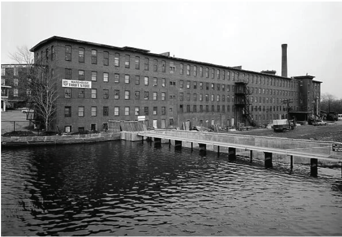
Figure 7: Massachusetts' Waltham Mills Buildings

For fire safety reasons a lot of the maritime industrial structures were built with as least obstructions as possible. This is the main reason why the interior walls are free of any wall coverings or decorations. Leaving the building services and construction completely visible. Furthermore the use of flat roofs, large window openings and partition-free interiors would be beneficial to extinguish any fires that could occur in these structures. (Jevremovic & Vadic, 2012)