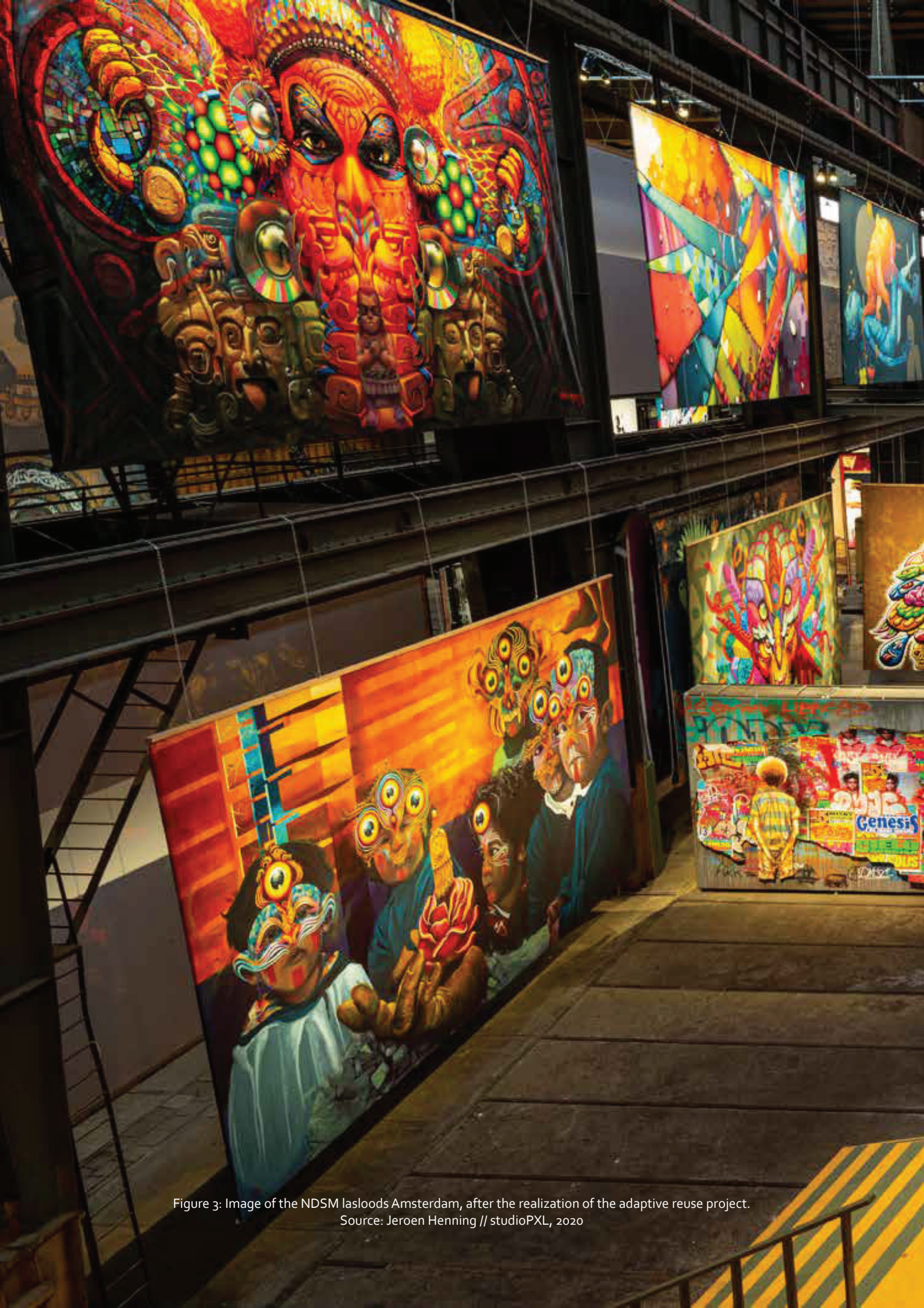
Figure 3: Image of the NDSM lasloods Amsterdam, after the realization of the adaptive reuse project.