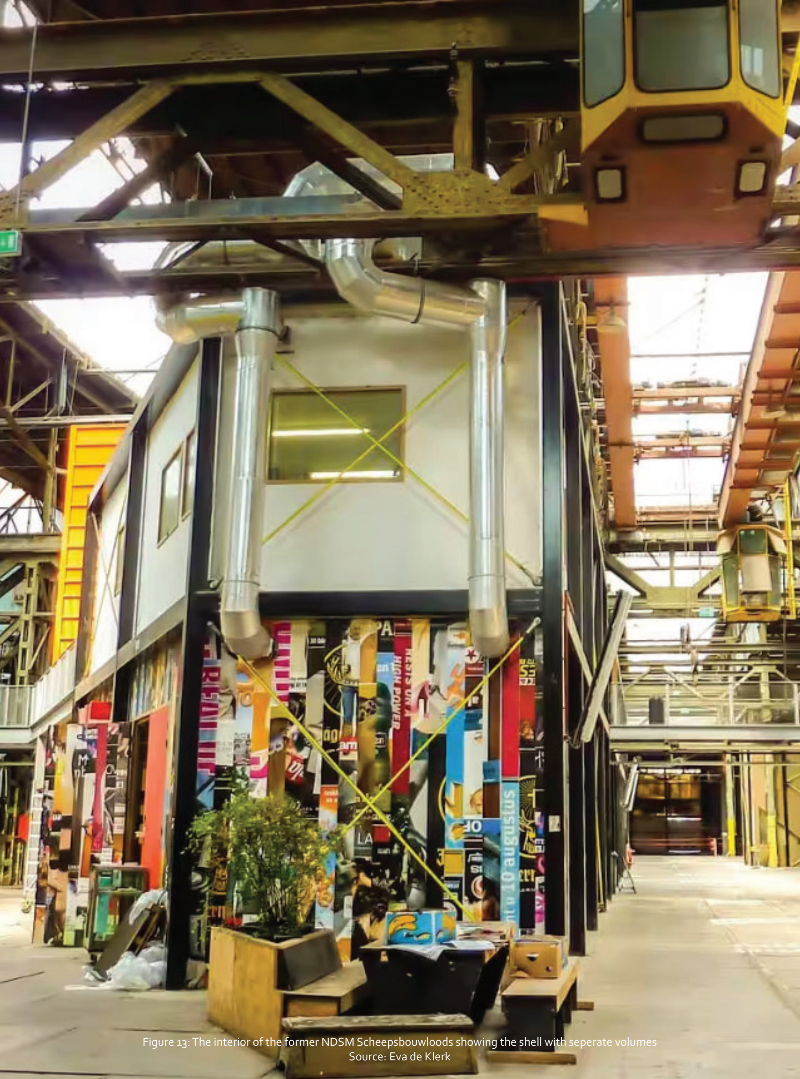
Figure 13: The interior of the former NDSM Scheepsbouwlouids showing the shell with separate volumes