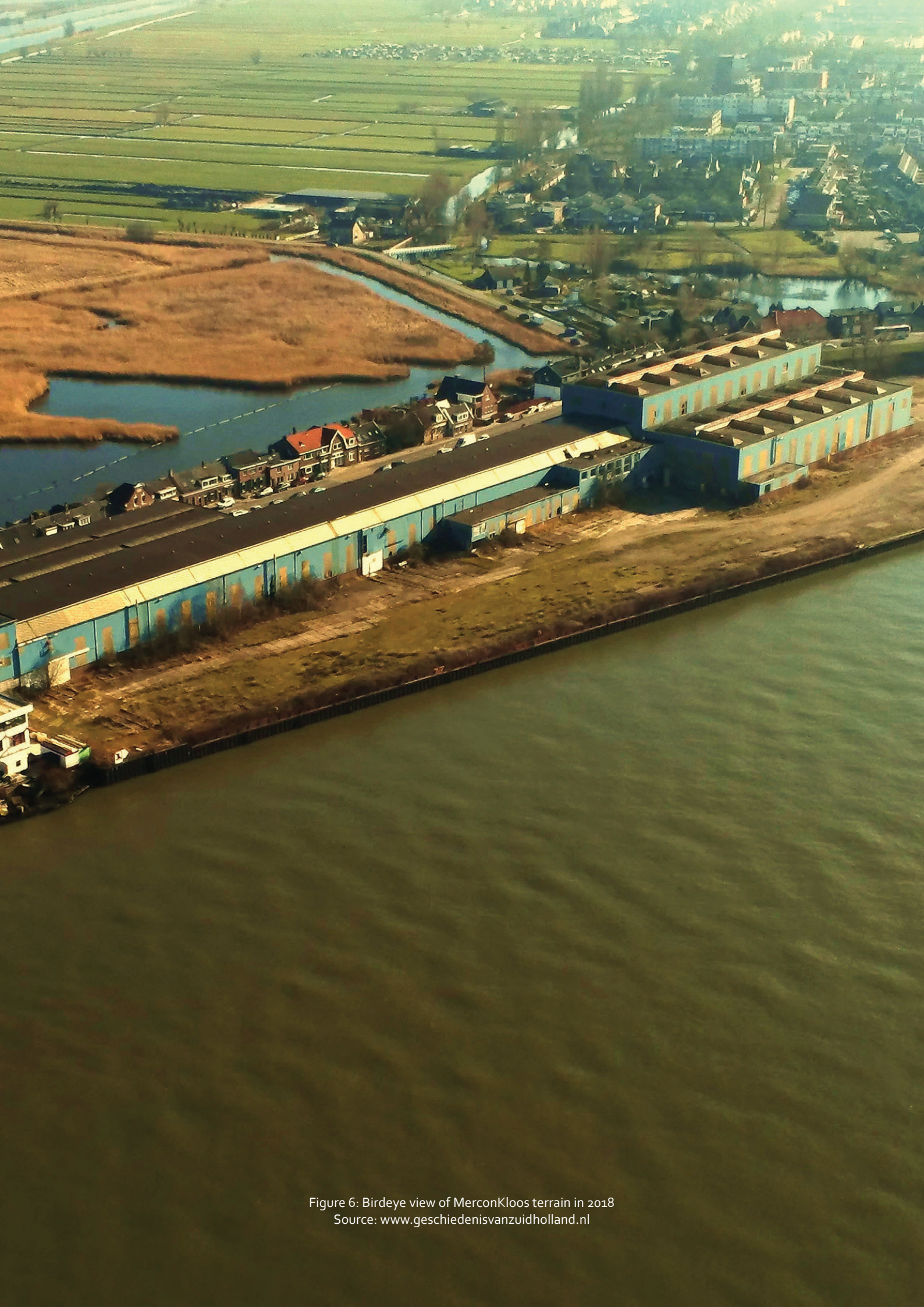
Figure 6: Birdeye view of MerconKloos terrain in 2018