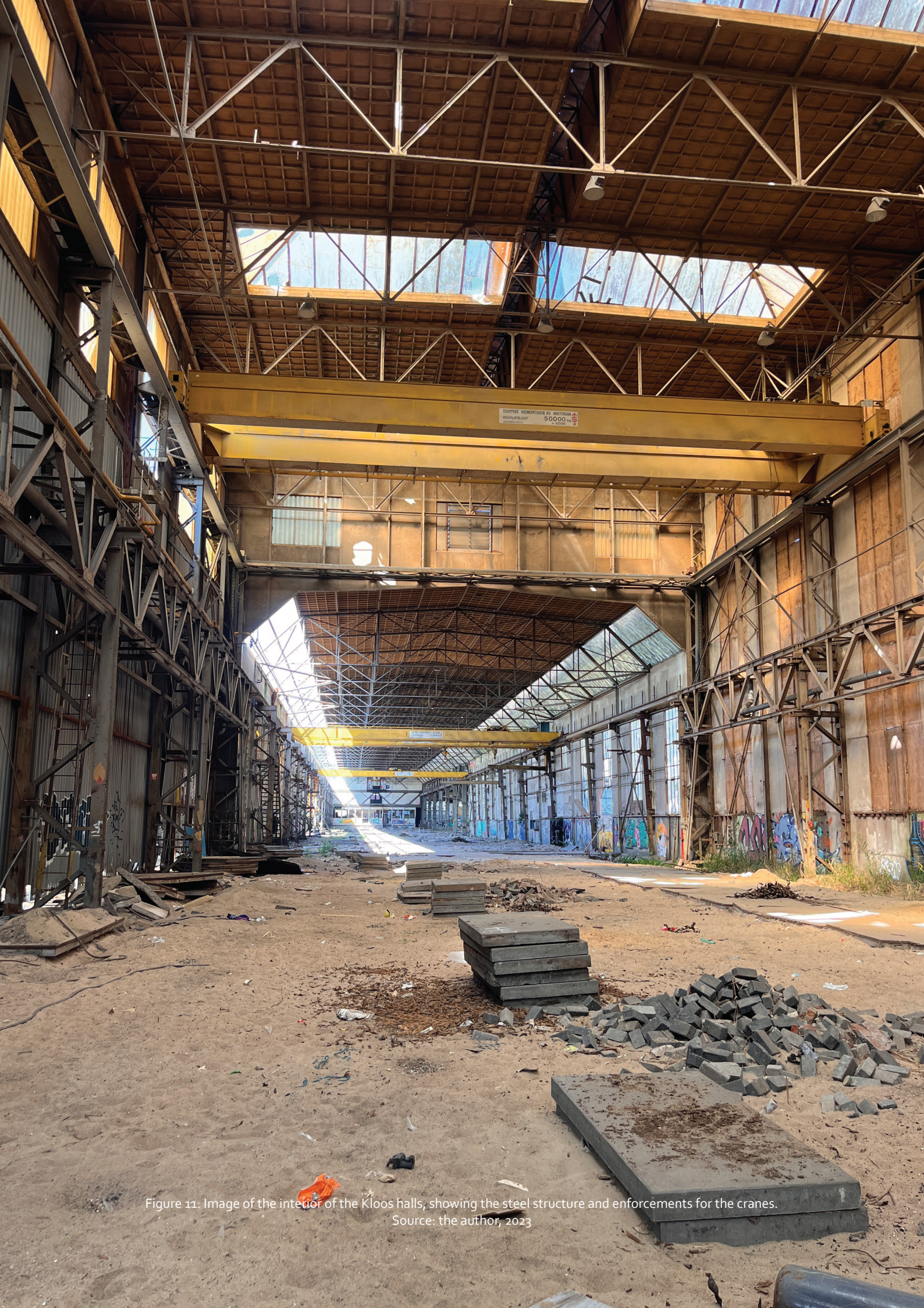
Figure 11: Image of the interior of the Kloos halls, showing the steel structure and enforcements for the cranes.