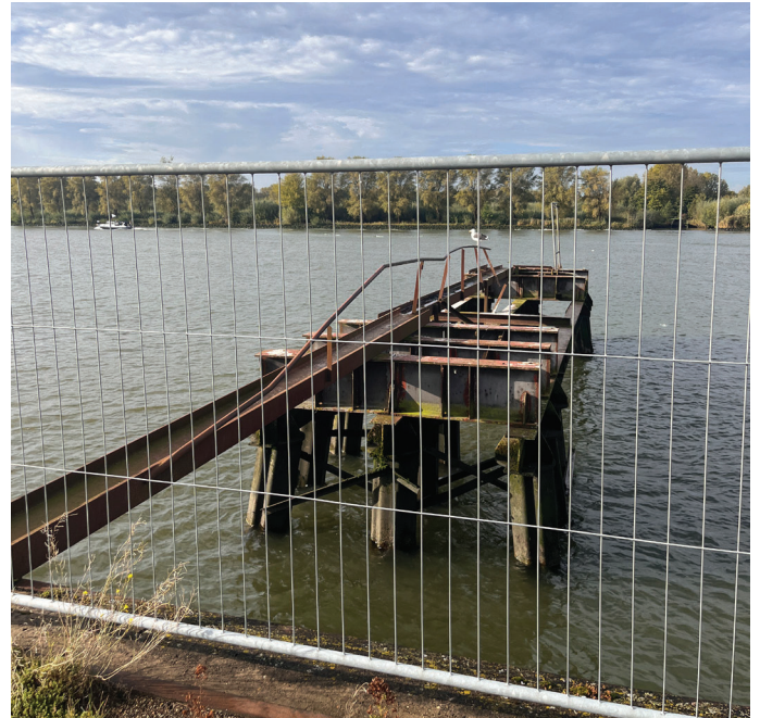
Figure 8: Image of the remains of one of the piers at the Kloos site

The site of Kloos is characterised by its long and slender shape oriented next to the river Noord. This placement next to the river already gives it part of its maritime character. This is further strengthened by the several traintracks, mooring buoys and remains of the piers. (figure 1 and 8)