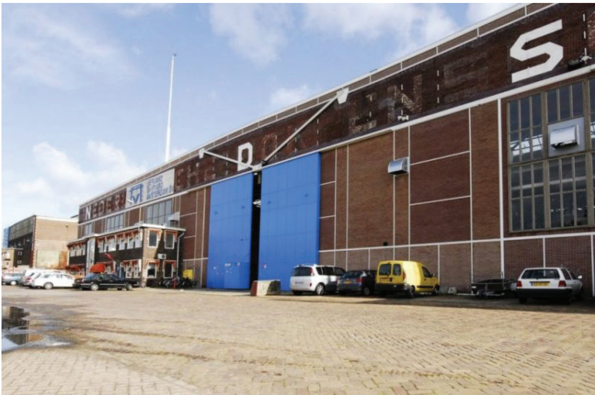
Figure 15: Image of the exterior of the 'Scheepsbouwloods', left mostly intact to the original state as found before the adaptive reuse project.