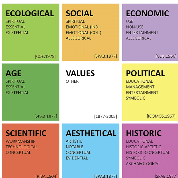
Figure 4: The Values Framework