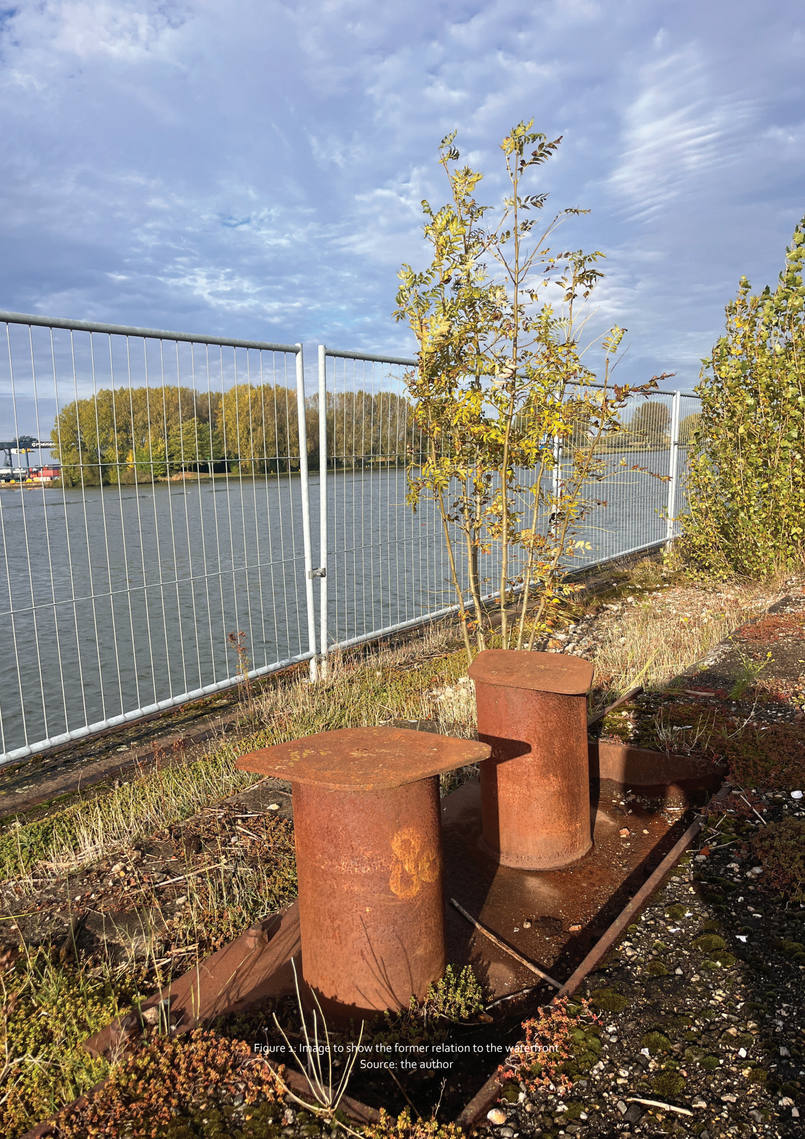
Figure 1: Image to show the former relation to the waterfront