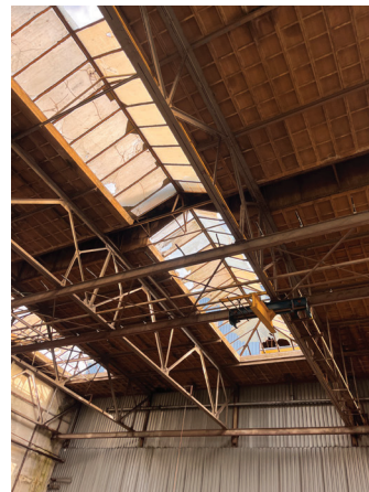
Figure 9: Pyramid skylights

In the skin of the structures there are several elements that are in line with characteristics found in the literature research. Such as the rhythmic structure of the facade, build up out of steel structural elements with brick fill-in and large openings. The large window openings have steel lightweight structural frames. And daylight is also let in through the pyramid shaped skylights. (figure 9 and 10)