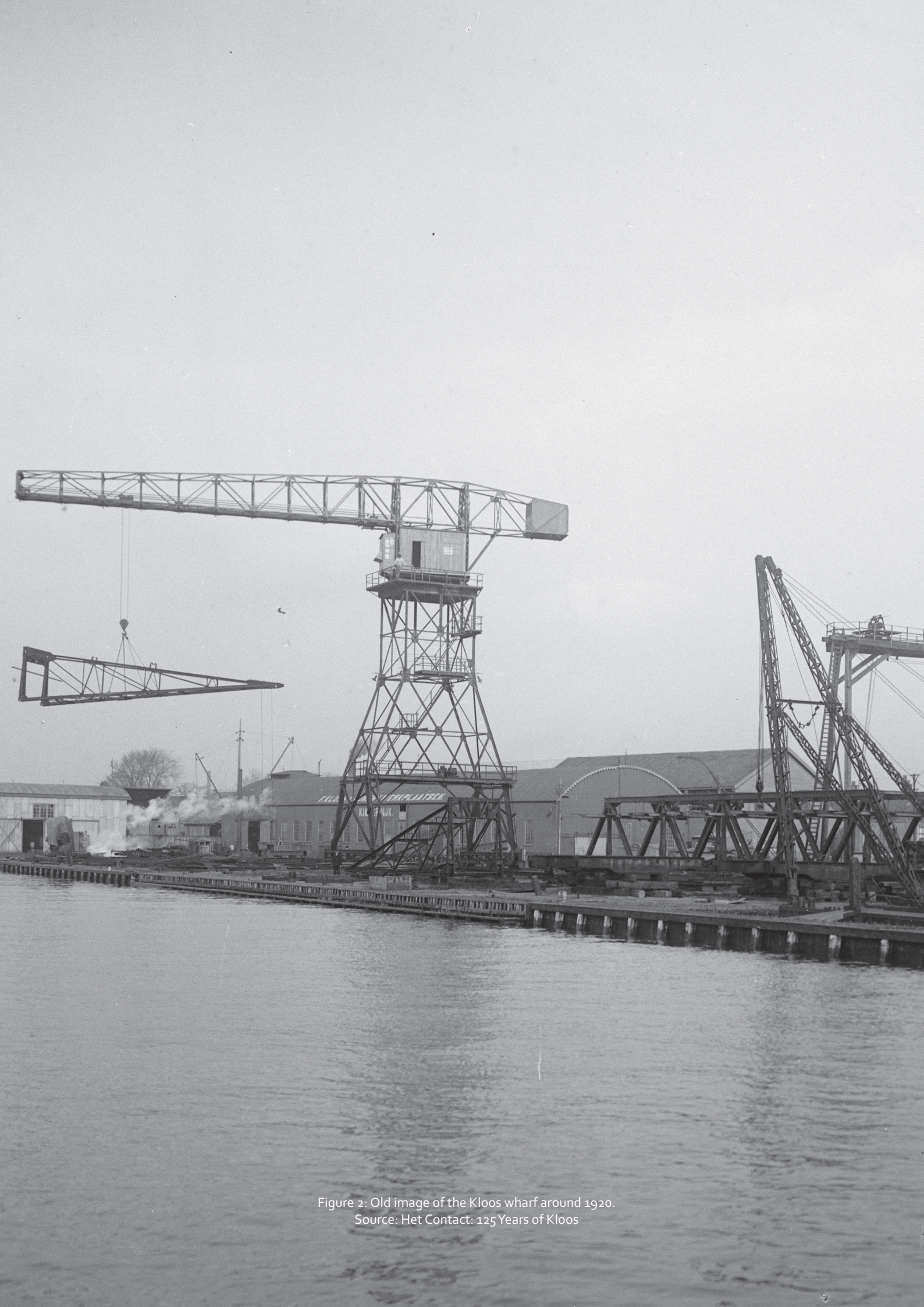
Figure 2: Old image of the Kloos wharf around 1920.