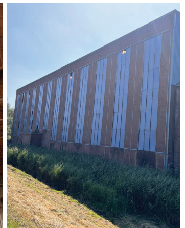
Figure 10: Rhythmic windows

The structure is mostly still intact and is typically made out of steel columns in combination with steel trusses. Carrying the weight of the lightweight roof structure and enforced there where it supports the cranes. (figure 11)