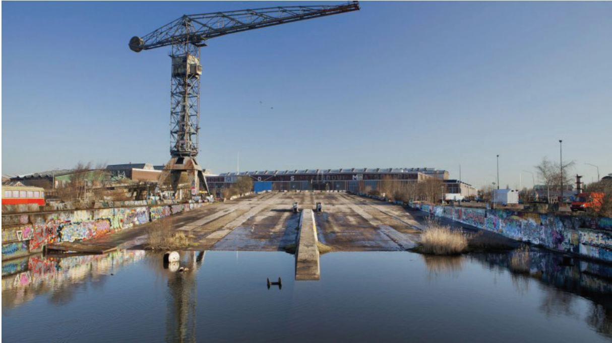
Figure 14: Image of the Y-ramp at the NDSM wharf, after restoration. Unfortunately without a strong connection to the 'Scheepsbouwloods' and its new functions.