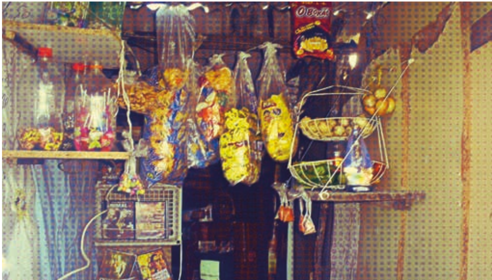
Figure 2. Window-shop, a spatial device that allows inhabitants to trade products and preserve their domestic lives.

According to Alejandro Aravena, 10 social practices address the need for synthesis, which architects and urban planners consistently seem to face. Adding to that, I believe that labour provides a synthesis for the design of slums. Numerous spatial attributes and planning rationales indicate how labour was imperative to the design of the Favela Sururu de Capote slum, literally shaping it. The alleys of this slum are straight because they have to facilitate the transportation of sururu from the lagoon to the women's houses or to the sales point of sururu . This contradicts predominant literature on informal settlements which states that favela alleys are "rhizomatic." 11 Moreover, many spatial attributes or incremental capacities of space are related to the need to work and dwell at the same time. (Fig. 2.)