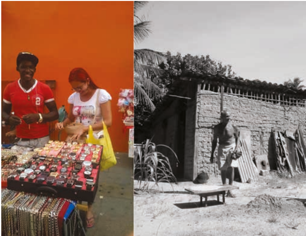
Figure 6. Migrants and inhabitants of favelas (transnational migration from Africa and rural northeastern regions).

studies presented at the 2016 Venice Biennale. The importance of considering labour as a design factor within informal settlement development was highlighted here to stress questions raised at the Biennale. At that forum, Aravena stated that, irrespective of their political, economic or environmental views, architects are ultimately designers. 32 In today's world, the impact of architectural design in cities is not only an effort to synthesize issues on a single project, but also an effort to theorise on how complex social phenomena directly affect individual lives in everyday life.