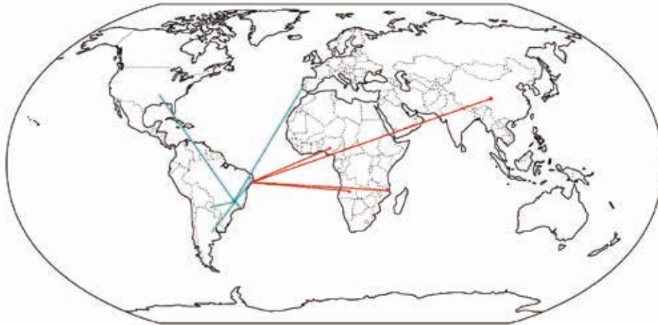
Figure 5. Flows of people and goods to the slums in Maceio (red) and destination of goods produced in slums in Maceio within a broader economic system.

settlements also stimulate eastern countries to set parts of their productive system in the southern hemisphere. The production of food is greatly processed in agricultural fields in China, retail manufacturers have factories in India or employ slum workers from the southern hemisphere. A new cartography and epistemology of labour in the world is crucial to understand the appearance and growth of the slums. (Fig. 5.)