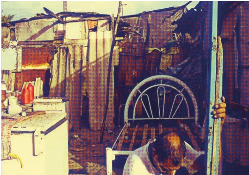
Figure 1. Man building a house in the Favela Sururu de Capote.

activities, NGOs, UPPs ( Unidades de Polícia Pacificadora ) and other similar activities are constantly increasing.