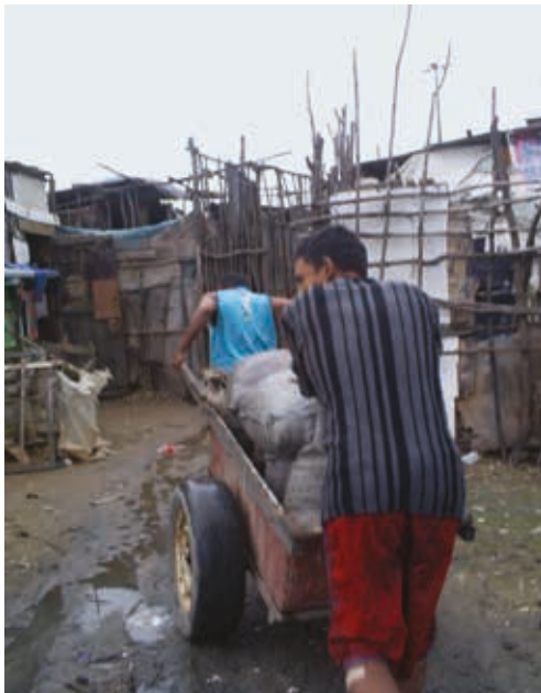
Figure 3. Man carrying sururu along the alleys of the Favela Sururu de Capote. Photo by Author, 2009.

The need to work and thrive goes beyond the constitution of a space, but it is part of its phenomenology. A house is shaped around the needs of