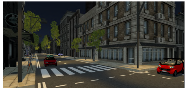
Figure 1: Night mode of the coupled simulator.

The simulator supports a keyboard and a gaming steering wheel as input sources for drivers of manual cars, a keyboard for passengers of AVs to control an external Human-Machine Interface (eHMI), and a motion suit for pedestrians. The output sources are head-mounted displays and computer screens.