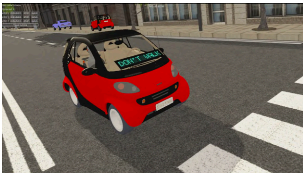
Figure 3: View of the AV from the pedestrian's perspective.

Participants had specific roles. PED was informed that the cars he would encounter were either AVs with eHMIs or manually driven vehicles. He was instructed to cross the road when he felt that it was safe enough to do so. The DM was instructed to violate the traffic rules and to not stop in front of the zebra crossing. The PAV was instructed to switch on the eHMI as soon as the AV started braking or when the DM violated the traffic rules.