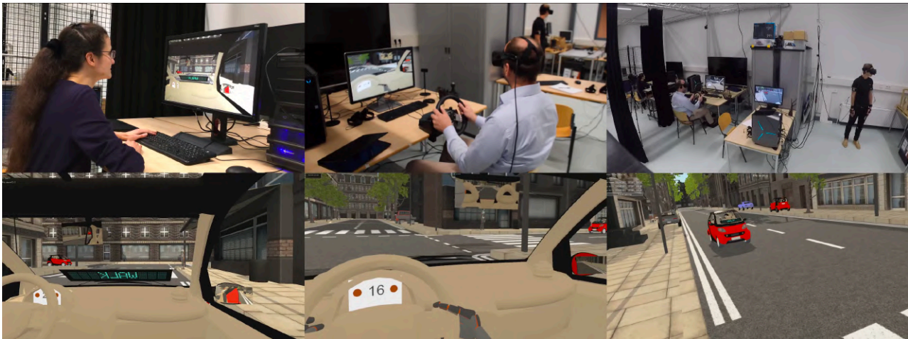
Figure 2: Scenario as seen by the participants. Top row: recordings from cameras aimed at the passenger in the AV, the driver in a manual car, and the pedestrian, respectively. Bottom row: Screenshots of the corresponding participants' views.

Participants had specific roles. PED was informed that the cars he would encounter were either AVs with eHMIs or manually driven vehicles. He was instructed to cross the road when he felt that it was safe enough to do so. The DM was instructed to violate the traffic rules and to not stop in front of the zebra crossing. The PAV was instructed to switch on the eHMI as soon as the AV started braking or when the DM violated the traffic rules.