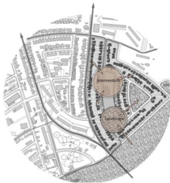
Linking the building with bungalows

Furthermore, the Complex Projects graduation studio promotes positioning architecture within a broader social, cultural, political and economic context. this aspect gave me an important handle when it was time to choose 'what to design'. it had to make sense, it had to be needed. To simply impose a chosen program on a site that does not ask for it, was not an option. but y researching not only the site, but also this wider context, it was easier to find an answer and it becomes easier to defend this choice.