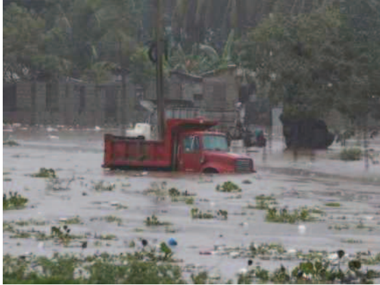
Figure 2. Floods in Cap-Haitien, February 2022