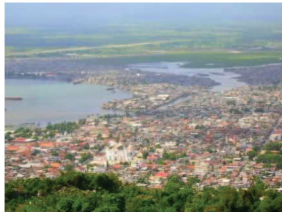
Figure 1. Panoramic view of Cap-Haitien City, Haiti. The Haut du Cap River flows from the right to the sea on the left.

formerly Delft Hydraulics (Netherlands), based on the complete Saint-Venant equations. We applied the models to different scenarios of urban growth and population pattern, deforestation in the mountains, and climate change, basing the latter on the rcp2.6 and rcp8.5 scenarios for greenhouse gas emissions. We used a DEM of 30 x 30 m 2 with a global soil and land use map to delineate the SWAT Hydrological Response Unit (HRU) under the baseline scenario (actual land use), modified land-use scenario (10% of urban area increase), and climate change scenario. Additionally, we modeled events with different return periods in SOBEK1D2D, including the November 2012 event.