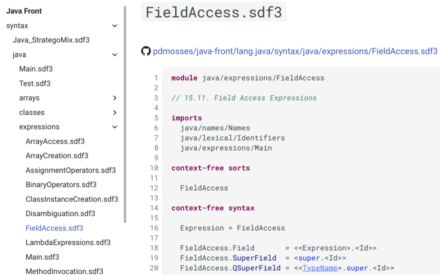
Figure 5. Browsing the same file in the hyperlinked twin.