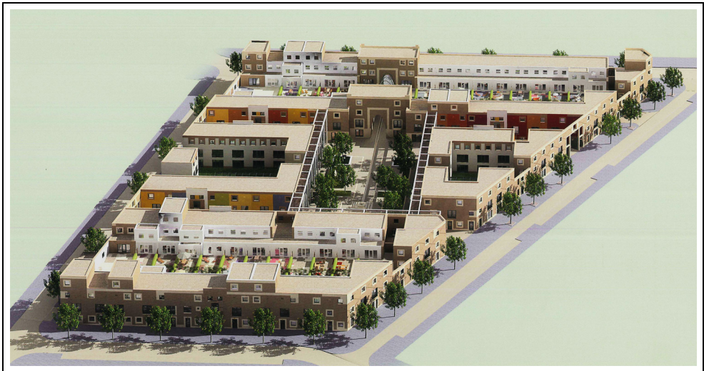
Figure 1. Scale model of Le Medi .

and Surinamese (12%) background; 90% of the children living with their parents in the neighbourhood have a migrant background (CBS, 2013). The neighbourhood is centred on a busy shopping street and a market (which operates twice a week), with most of the vendors in both sites having a non-Western foreign background. The development process of the complex Le Medi started in 2000, when a Rotterdam-based businessman of Moroccan descent proposed to build an Arabian style neighbourhood 'to show the wealth and riches of Arabian culture (...) in a time when people spoke about migrants in a rather negative tone' (Van Dael, 2008). His initiative was welcomed, as the city was encouraging 'multicultural planning' in that period (Van der Horst and Ouwehand, 2012). Two housing associations, later joined by a private developer, adopted the project and found a site in Bospolder-Tussendijken. The initiators of Le Medi first gained familiarity with Arab architecture by visiting Morocco. They then organised a 'branding