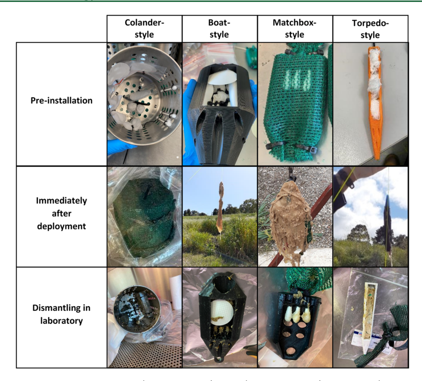
Figure 1. Four designs of passive sampler units: colander (far left column), boat (mid left column), matchbox (mid right column), and torpedo (far right column), before deployment (top row), directly after deployment (middle row), and during processing in the laboratory (bottom row).