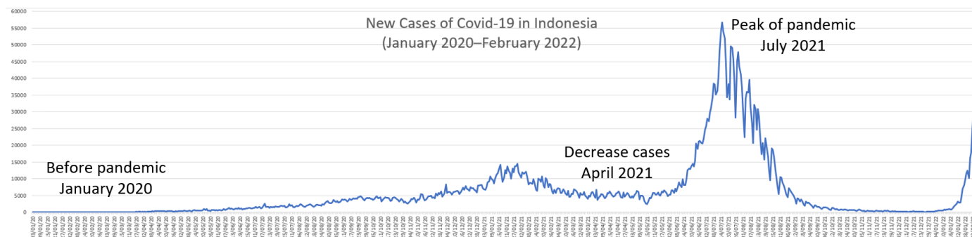
Figure 1. New cases of COVID-19 in Indonesia [3].

The study used a cross-sectional design. The purpose of this study was to gain an overview of changes in university students' behavior in implementing health protocol (wearing masks, maintaining distance, washing hands, staying away from crowds, and limiting mobility) related to the COVID-19 pandemic in 3-time phases (before the pandemic, i.e., before January 2020; during low cases, i.e., around April 2021; and the peak of the pandemic, i.e., July 2021), which are shown in Figure 1.