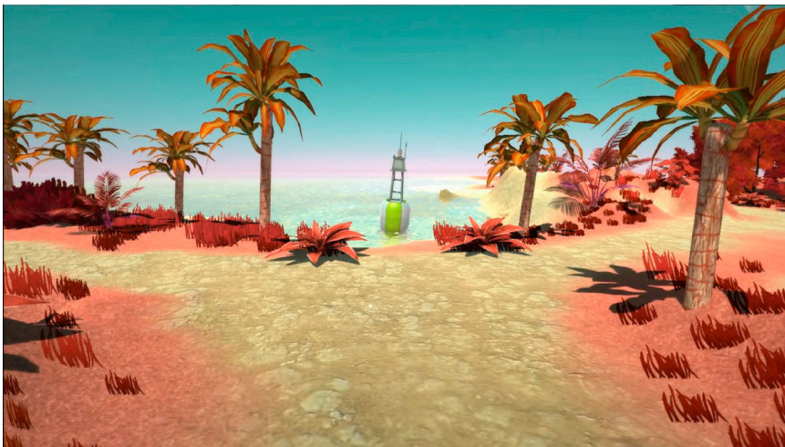
Figure 1. A screenshot of the navigation task indicating one of the eight landmarks in the environment.

The objective navigation assessment was identical to the experimental design described in van der Ham et al. (2020). Participants watched a 69-s movie in which a virtual environment was explored. In the video, a path through a fictitious forest was traversed from a first-person perspective on normal walking speed. The environment consisted out of 8 intersection points (5 two-way intersections, 3 three-way intersections). The stroke of land alongside the path was filled with vegetation and dunes, making it impossible to see previous and upcoming components of the path. Along the path, participants would encounter 8 distinct landmarks (oil barrels, spaceship, science fiction crate, rowboat, car, container, buoy and a formation of crystals) (Figure 1).