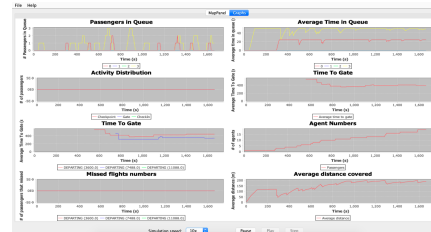
Fig. 2. AATOM analyzers.