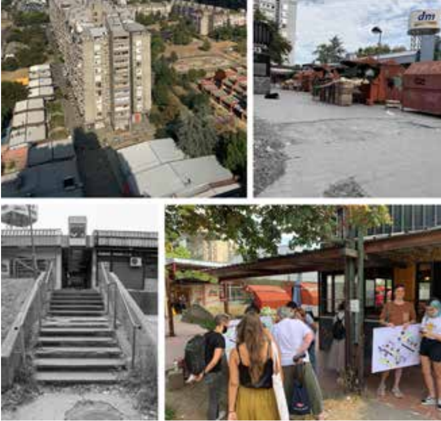
Figure 4. CMZ in Block 23, New Belgrade. Photography © Ivona Despotovic, Tamara Popovic, Zorana Jovic: Student Workshop, Belgrade, September 2020.

and community empowerment, as two main points of the CMZ concept, meet? An integrated perspective on production and consumption was in the core of the socialist idea of the local communities. The concept of prosumers is being re-discovered in recent urban studies. Thornham and Parry (2015) study this relation, and in particular in context of local community centres. They note that the local community centres are “emblematic of civic culture and community ‘empowerment’, through in particular a discourse of entrepreneurialism” 22 . A social enterprise model, applied in case of the Bread Houses Network, unites community-building, creativity and social entrepreneurship. 23 The local community centres in New Belgrade have a high-level potential to (re)affirm this idea of productive, proactive and creative communities and promote integrated reuse . Moreover, they have the socio-spatial capacity for promoting participation and bottom-up governance as direct democracy in the city, and thus, further empowerment of community, solidarity and sense of belonging. In this way, the local community centres, as condensed zones of common activities and proactive