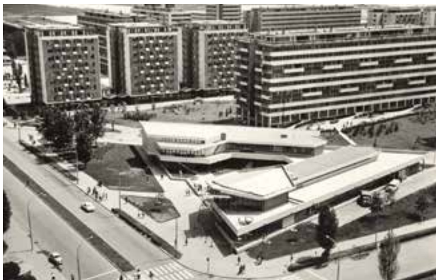
Figure 1. Uros Martinovic, CMZ in Block 1, New Belgrade.

As Aleksic (1980) argues, “local community centres are emerging as coordinators of living in the blocks – in physical and social sense; they are a basis for solidarity and sense of belonging to the community” 1 . The first CMZ in Yugoslavia was the one in Block 1 in New Belgrade, built in the period 1963–1967 2 (Fig. 1).