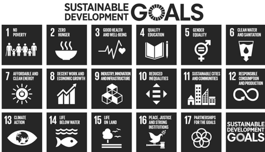
Fig. 1 United nations sustainable development goals.

This means that to achieve the stated goals of the 2030 proposal, an integrated and comprehensive understanding of the goals is necessary. Reading the goals, then, as being separate or as rank-ordered is not the correct approach. Instead, they are best read as being mutually co-constitutive of one another. Furthermore, a more general understanding of global system’s thinking and complexity sciences is critical to understanding the various effects of different artefacts and subsystems within a more extensive interactive network, rather than the isolation of discrete entities (Ballew et al. 2019; Briscoe 2015; van de Poel 2020). The resulting complexity of