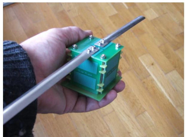
Figure 3. BME-1 [15].

Very small satellites (relatively speaking, as absolute size and distance are linked to the minimum detectable size by sensors) are thus at the edge of the detection capabilities and are the best objects to characterize performances. It should also be noted that active small satellites can be considered having a size similar to debris generated in