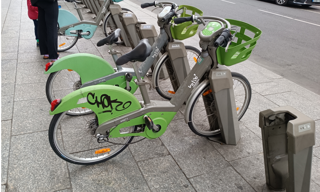
Figure 1: Two Vélib' bicycles, both have their seat turned to indicate they are broken. The chain of the closest one is drooping, which is an additional indicator for those familiar with bicycles.