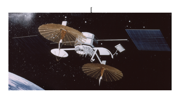
Fig. 1. Tracking and Data Relay Satellite of the 1st generation, an artist's impression.

The first ad hoc experimental demonstration of SVLBI was conducted with the NASA's geostationary Tracking and Data Relay Satellite System ( TDRSS ) in 1986 [13], Fig. 1. Its geostationary satellite was equipped with two 4.9 m antennas, one of which was used in this demonstration as a radio telescope. The observations were conducted at 13 cm and 2 cm together with a network of large Earth-based antennas in Australia, Japan and the US.