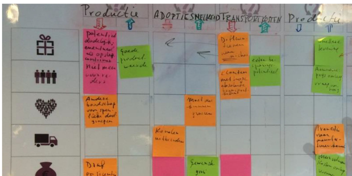
Fig. 4 Stress testing of the HCI business model

The company found Stress Testing most useful, because the sessions led to deeper insight into entering unserved new markets with their BM. The Stress Test and questionnaire data showed that the new market strategy of FairShare is viable, but radical changes must be made to prepare for critical uncertainties. “Our Business Model needs to be sharpened anyway, each year” and “The BM remains useful, but we have to develop a new improved product and introduce it on the market”, which implies the creeping in of a sustaining strategy – just in case.